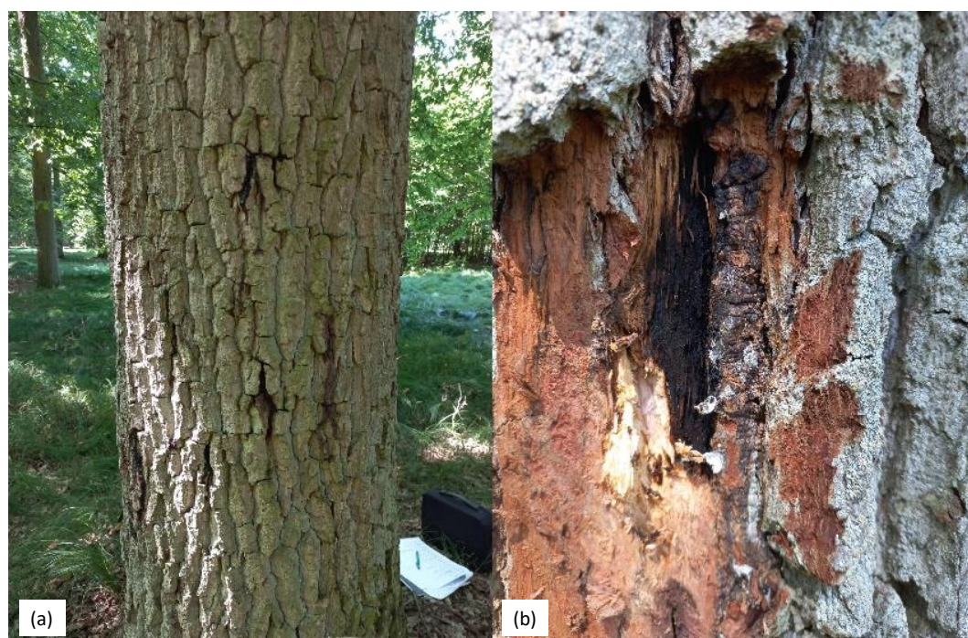
Figure 1. (a,b) Longitudinal cracks on the trunks of common oak ( Q. robur ) trees showing brown to black lesions accompanied by exudation.

Typical symptoms of bacterial canker were observed on English oaks in certain areas of the Krotoszyn Plateau. These symptoms included weak trees and brown to black lesions on the boot, accompanied by the release of black sap in spring, summer and autumn. The affected trees showed a progressive loss of vigour and a decline in foliage. In some cases, the bark cankers were clearly visible and reached up to 10 cm (Figure 1a,b). Of the 54 trees selected for analysis, the presence of B. goodwinii was confirmed in 24 trees. G. quercinecans was confirmed on 12 trees. The data that refer to the results of the real-time PCR method are presented in Table A1 in Appendix A. In the second work phase, in which tissue was taken from trees where the presence of the bacteria mentioned was confirmed, isolates were only obtained for B. goodwinii and G. quercinecans , and these isolates were subjected to further analyses. A total of 12 isolates described as B. goodwinii and 6 described as G. quercinecans were obtained. Both bacteria together were confirmed only in four trees. These trees had varying numbers, but importantly, of all the trees from which isolates were obtained, only two showed signs of Agrilus biguttatus feeding.