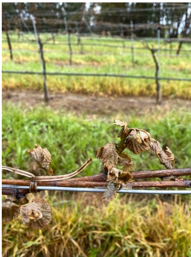
SUPPLEMENTARY FIGURE S2. Injury to the experimental vines recorded after the April 15 th , 2022, frost event.