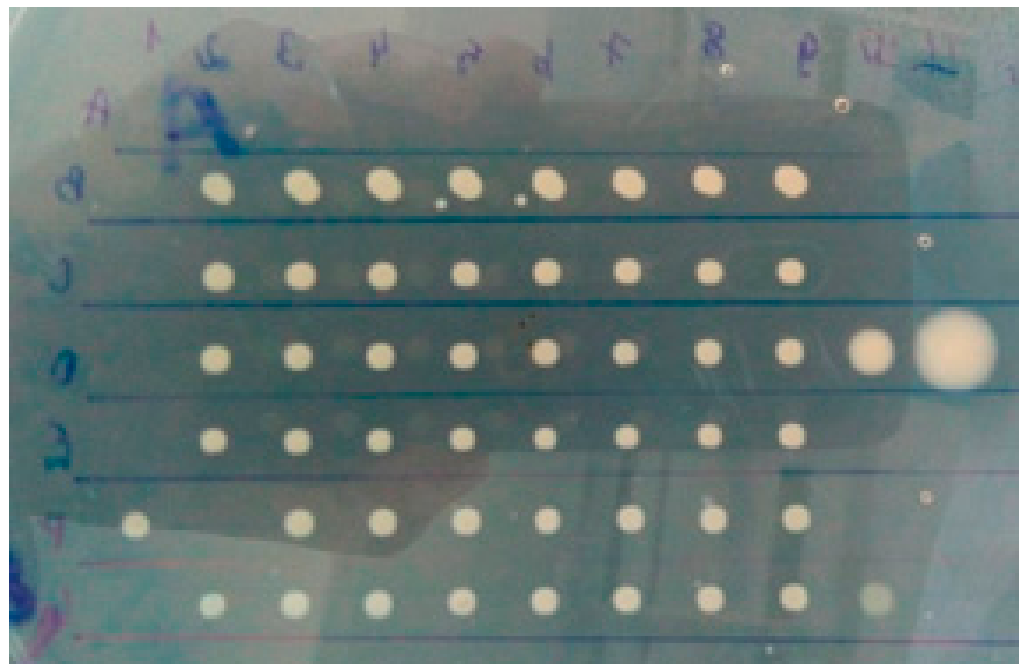
Figure S2. Minimal inhibitory concentration (MIC) for AW30 (B, C, and D) and AW70 (E, F, and G) samples against Salmonella spp.