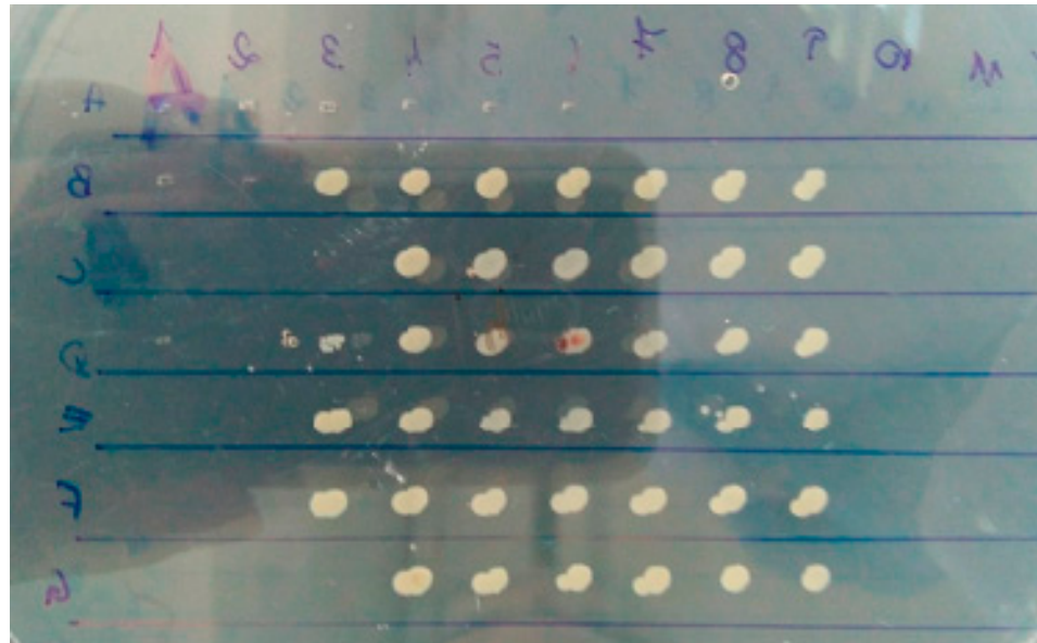
Figure S1. Minimal inhibitory concentration (MIC) for AW30 (B, C, and D) and AW70 (E, F, and G) samples against E. coli .