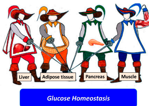
Figure 2. Liver as the fourth “musketeer”. This figure identifies adipose tissue, skeletal muscles, and pancreas as the three key organ systems controlling glucose homeostasis in humans. Together with these three organ systems, the liver also plays a key role in glucose disposal in health. Consistently, a large number of studies based on both the NAFLD and the hepatitis C virus (HCV)-related liver disease spectrum have highlighted the pathogenic role of the liver in the development of type 2 diabetes mellitus. (Modified from ref. [42]).

Clearly, if NAFLD is closely linked with both circulatory endothelial dysfunction and metabolic syndrome features, one might anticipate that NAFLD may also predispose to the development of chronic kidney disease (CKD). In their review of published and ongoing studies, Marcuccilli and Chonchol addressed this interesting topic and concluded that there is now substantial evidence linking NAFLD to CKD development [44]. The mechanisms underlying these two diseases are complexly inter-woven; thus, additional experimental and clinical research is required, including data on both liver and kidney histology. Of interest, lifestyle changes aimed at weight loss and increased physical activity may prevent and benefit both diseases. Finally, physicians’ awareness may lead to screening of CKD among patients with NAFLD and thus to earlier detection and treatment and to improved outcomes in patients with NAFLD and spared organ transplantations [44].