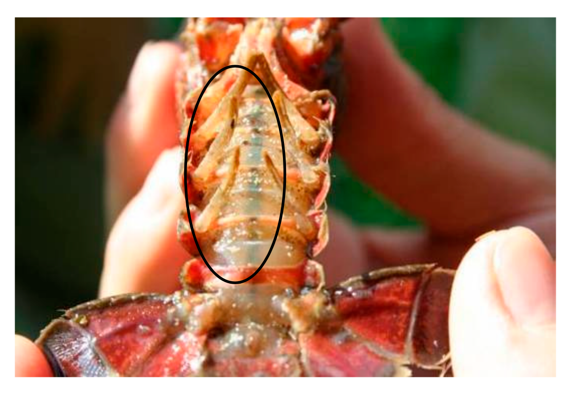
Figure 3. Individual alien temnocephalan crayfish ectoparasite Temnosewellia minor on a specimen of Procambarus clarkii .

1888 (Figure 3), an ectoparasite always carried by C. destructor and described by morphological and molecular investigations in Chiesa et al. [22]. The crayfish plague analyses evidenced a positive result in two out of the 12 sampled P. clarkii , the first found in the output canal of the cultivation ponds, the second found in Stagni della Flora (Pantanello area).