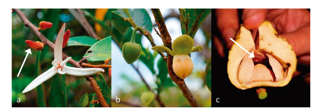
Figure 2. Flowers of three species of cantharophilous Annonaceae from our studies in the Cerrado of the Chapada dos Guimarães, MT, Brazil. Note that all three have light-colored perianths. (a) Xylopia aromatica has a mixed pollination system in which both thrips (Thysanoptera) and beetles (Coleoptera) take part. Flower visitation occurs mostly during the day, although flowers remain anthetic throughout the night. The adaxial surface of the outer petals and the linear inner petals are white. The abaxial surface of the outer petals, however, is of a vivid hue of red (arrow). (b) The calyx of Cardiopetalum calophyllum is light green, and the petals are light yellow. Flower visitation by nitidulids is diuturnal. (c) In this figure, it is possible to visualize the floral chamber of Annona crassiflora , delimited by the light yellow corolla. Pollinated by large nocturnal Cyclocephala scarabs (arrow), this species has large, thermogenic floral chambers. Note that the beetle shown inside has its head positioned toward the base of the inner petals, where the nutritious tissue patch is located.

In this same hectare, Gottsberger and Silberbauer-Gottsberger (2006) [66] showed that 92% of plant species flowered during the day, 6% were nocturnal, and 2% apparently attracted animals on a diuturnal basis. For the six sampled Annonaceae in the area, the trend inverted: most (four species) were nocturnal, and two species had diurnal anthesis. All Annonaceae were pollinated by beetles, with the exception of Xylopia aromatica (Lam.) Mart. (Figure 2a), which was mainly pollinated by Thysanoptera and, secondarily, by beetles. The corollas of Annonaceae species, except D. furfuracea , whose corolla is reddish, are light in color (yellow, creamy, and white). Annonaceae specialization to cantharophily is also noteworthy when, for all plants in the area, their pollinating agents are considered functional groups (i.e., large bees, wasps, small bees, and flies). Whereas 70% of the local plant species were pollinated by more than one group of animals (generalists), only one Annonaceae species, Xylopia aromatica (Figure 2a), was pollinated by more than one functional group (small beetles and thrips).