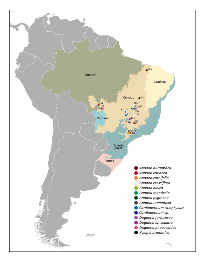
Figure 1. Brazilian biomes with Cerrado localities (circles) indicating Annonaceae study sites based on georeferenced published datasets. Circle colors refer to species, numbers to references cited. For further information, see Table 1.

Web of Science, ResearchGate, Academia.edu, Scielo) by applying combinations of search keywords (pollination, beetle, Coleoptera, Annonaceae, Cerrado ). Since a considerable part of the studies on this topic are in Portuguese, search keywords in Portuguese were applied in separate checks. References of cited publications were also checked for related topics. The complexity and interdisciplinarity of pollination biology rendered a necessary search for studies that do not directly address cantharophily, but still contribute to its understanding such as investigations on conservation and animal behavior. A geographical overview of literature-based Cerrado study sites is shown in Figure 1.