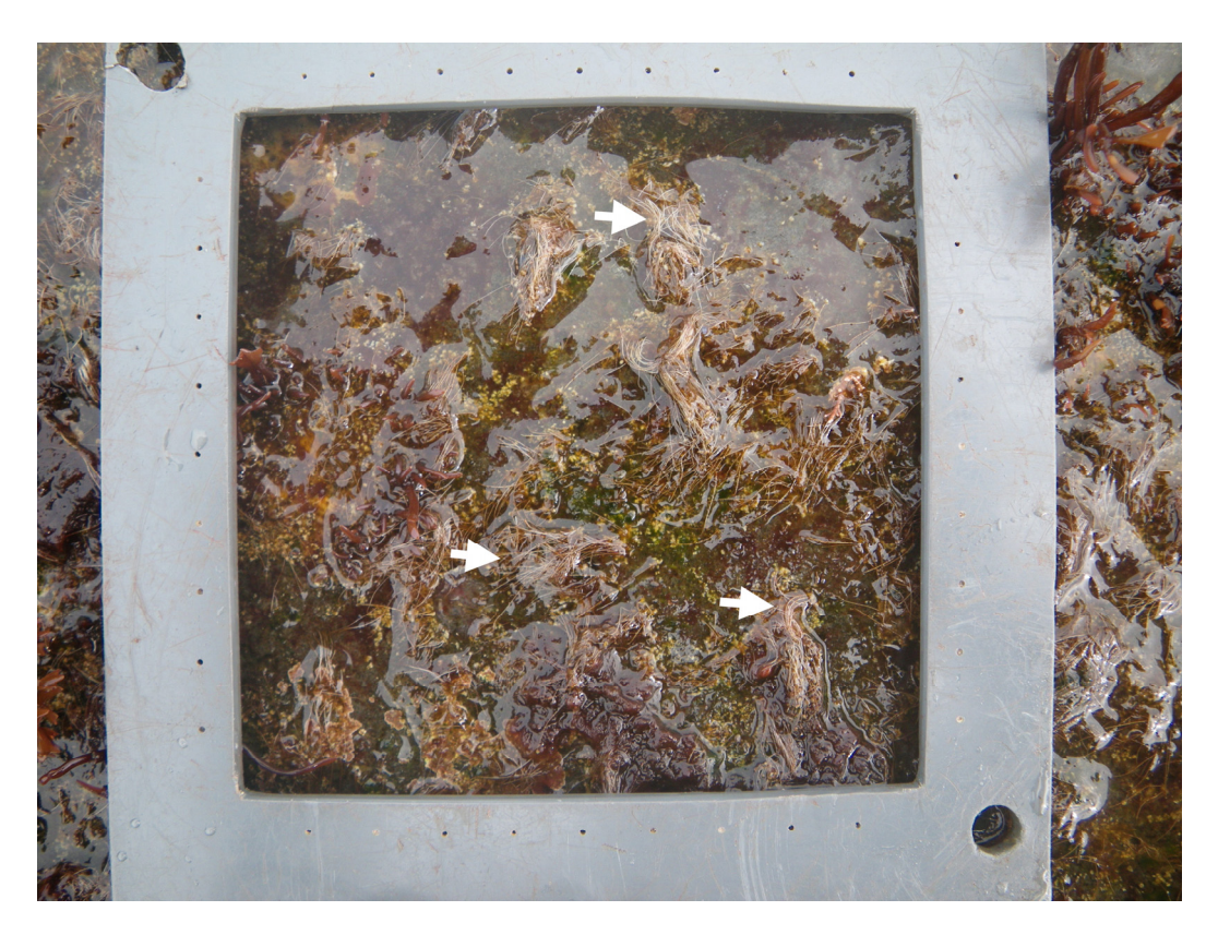
Figure 2. Close-up view of the mid-intertidal substrate featured in Figure 1b showing numerous byssal threads (examples are indicated by arrows) as the only remains of mussels on 29 September 2023, shortly after the passage of cyclone Lee. The inner frame of the PVC quadrat measures 10 \text{ cm} \times 10 \text{ cm} .

Funding: This study was funded by a Discovery Grant (#311624) awarded by the Natural Sciences and Engineering Research Council of Canada (NSERC) to the author.