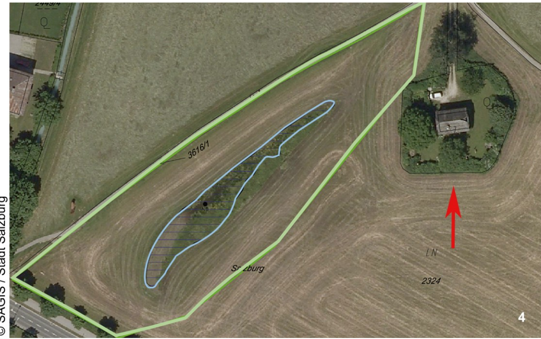
Figure 4. Officially protected area. Green outline: buffer zone. Blue outline: Krauthügel pond. The arrow denotes the house (frequently wrongly called "house of the hangman") where the watchman of the Krauthügel lived.

Four of the ten new ciliate taxa from the Krauthügel pond have also been recorded from other biogeographic regions: Actinorhabdos trichocystiferus was re-discovered in a soil sample on the outskirts of Rio de Janeiro (Foissner, unpubl.); Bilamellophrya hawaiiensis has been discovered in arable soil from Hawaii [27]; Coriplites grandis was discovered in soil south of the town of Cairns, Australia [48]; and Meseres corlissi has been recorded from China, Australia, Africa, and South America [11].