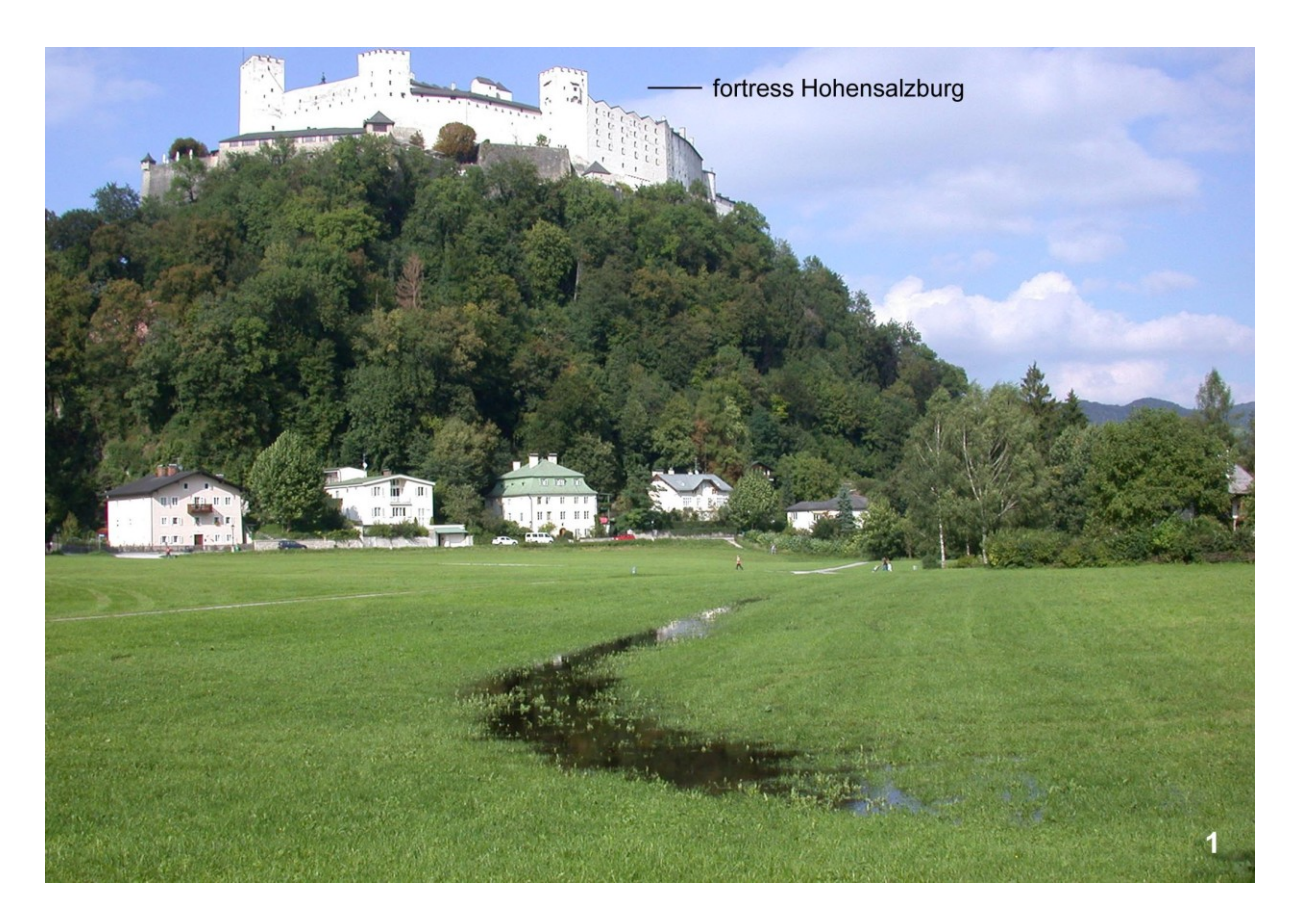
Figure 1. The Krauthügel pond when filled.