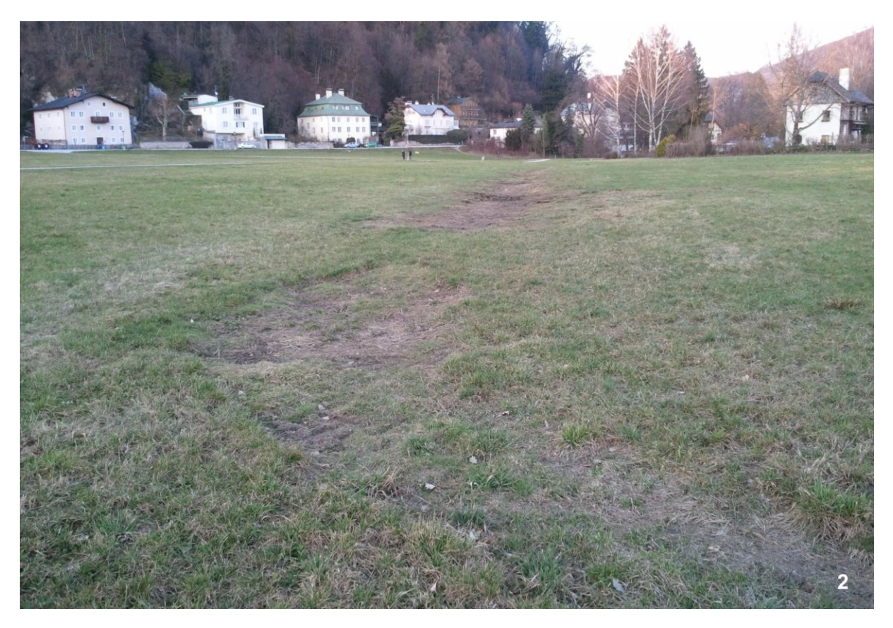
Figure 2. The Krauthügel pond when dry.