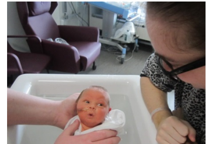
He listens and looks attentively at his mother and father.