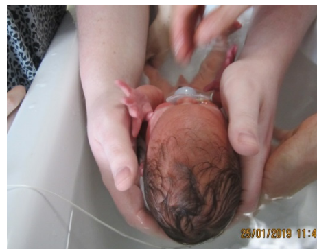
He flails his hands and legs when the support from the blanket disappears, despite his father's secure hands.