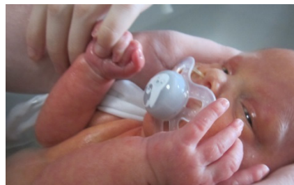
He is calm when he gets to hold on to something.