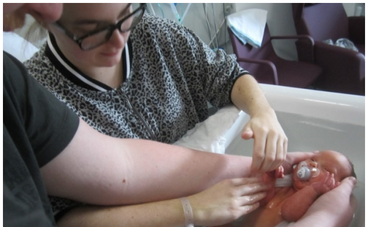
He falls asleep well after nursing