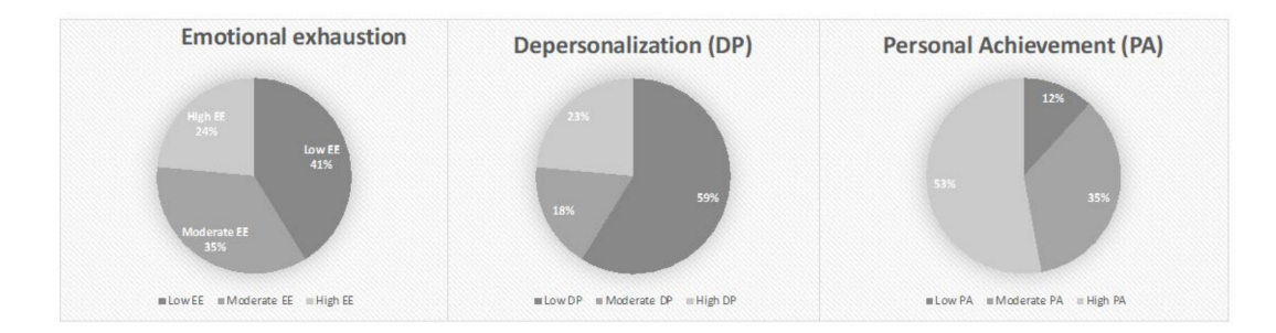
Figure 1. Three dimensions of Maslach Burnout Inventory-Human Services Survey (MBI-HSS) scores distribution.