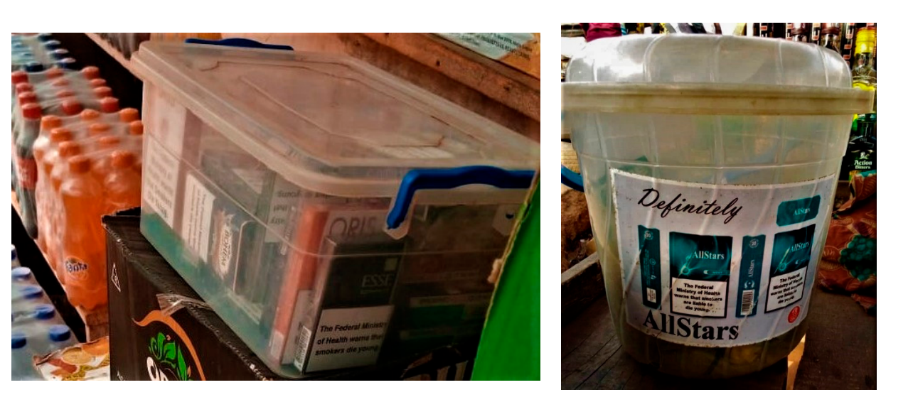
Figure 2. Pictures showing cigarette packs displayed in transparent buckets in Ibadan, Nigeria, 2022.

Most of the vendors had transparent plasticware where they put the cigarette packs. Some of these plasticwares were branded by the tobacco companies and given to the vendors by the sales representatives. Some vendors also created special shelves where they arranged empty cigarette packs and placed the shelves in front of their shops to get the attention of potential buyers.