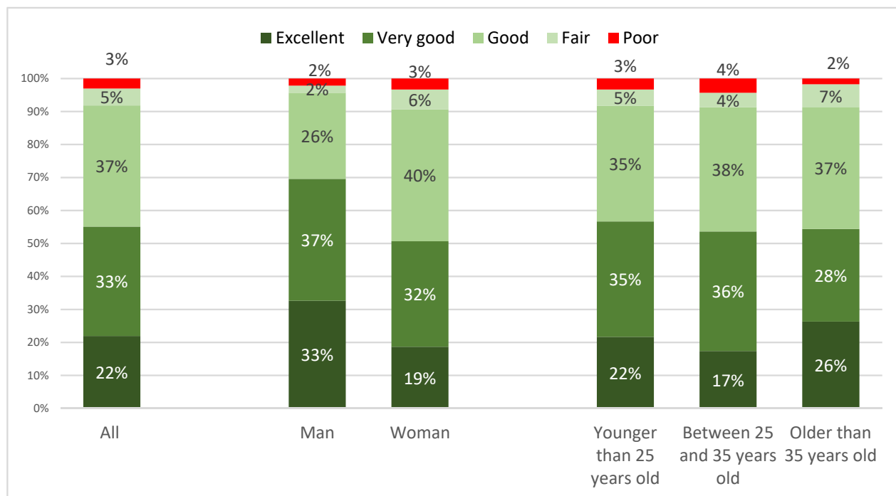
Figure 2. Self-rated health during COVID-19, by gender and age group, by percentage.

As seen in Figure 2, self-rated health, 55 percent of the academics in Iran say their health is excellent or very good. Another large share, 37 percent, say their health is good. That accounts for 92 percent who say their health is at least good. Only three percent say it is poor. Men more often claim that their health is excellent or very good, 70 percent versus 51 percent for women. Only very small differences occur across ages, as 57 percent of the young claim their health is excellent or very good, which, respectively, is 53 percent for 25–35 year olds, and 54 percent for those older than 35 years. Notably, the older group says that their health is excellent more often.