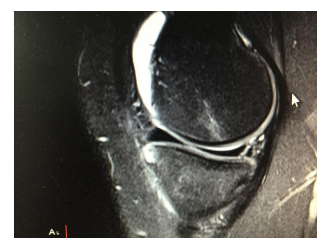
Figure 1. Magnetic resonance (MR) sagittal view of a right knee in 20-year-old male patient with a longitudinal meniscal tear in posterior part of medial meniscus.

All types of isolated meniscal tear (including radial, longitudinal (Figure 1), bucket handle and complex tears) with no other joint pathology (ligamentous or chondral lesion) were considered for repair if possible. Degenerative tears were not repaired. All repairs were performed arthroscopically with an outside-in and/or all-inside technique (Figure 2).