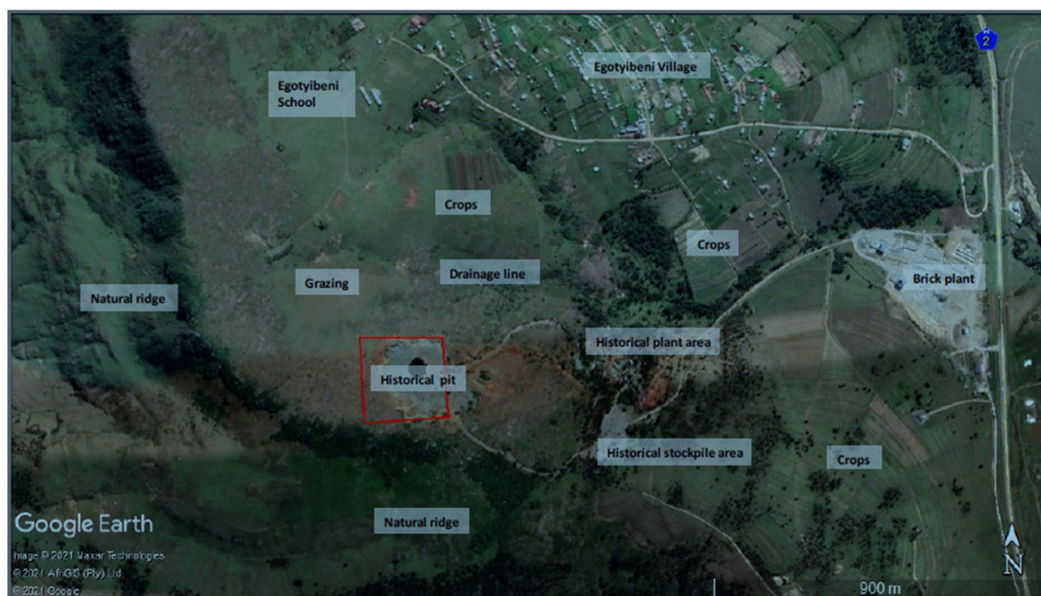
Figure 1. Land use and environmental sensitivity.

Surrounding land use includes a natural ridge and valley to the south and west of the site, grazing and subsistence agriculture to the north, and the historical plant and stockpile area to the east (see Figure 1). The only major infrastructure in proximity to the site is the N2 highway which at its closest point is approximately 1.5 km to the east (see Figure 2). The closest receptors to the site are the school and some homesteads forming part of the Sierra Village located approximately 600 m north of the site. The other village is located approximately 1km over the ridge to the west (See Figure 2).