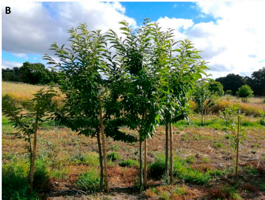
Supplementary Figure S2. Chestnut hybrids of SC1202 (A) and SC55 (B) genotypes ( Castanea sativa × C. crenata ) after 2 years in the field.