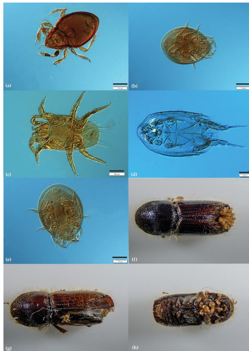
Figure 2. Five newly recorded mite species of I. typographus in Serbia and their position on the body of the bark beetle. (a) Paraleius leontonychus , (b) Uroobovella ipidis , (c) Dendrolaelaps quadrisetus , (d) Histiotostoma piceae , (e) Trichouropoda polytricha . (f) Mites on the elytra declivity of I. typographus , (g) mites under the elytra of I. typographus , (h) mites on the thorax of I. typographus .