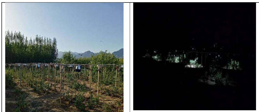
Figure S2. Images of the field experiment during the day and at night. (Note: the extra pots were used for other experiments, and did not cause cross influence in this study).