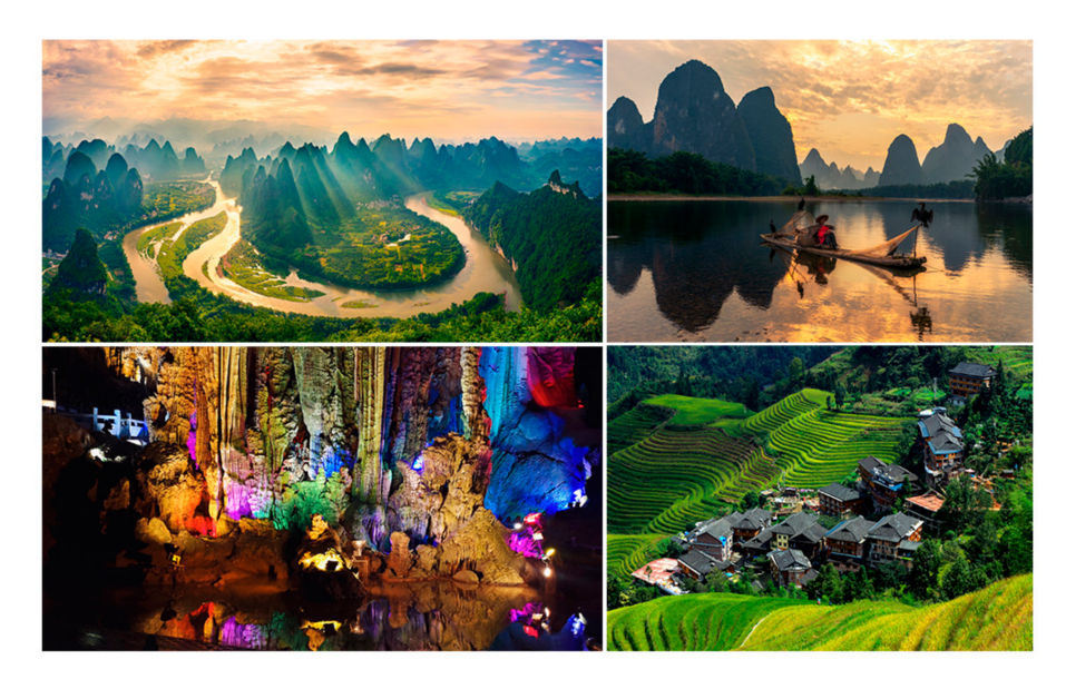
Figure 2. Ecotourism resources and scenic views of Guilin. Note: Li River (top left and right); karst cave (bottom left); rice terraces (bottom right); the pictures are courtesy of Shanghai Tuchong Network Technology Co., LTD of China.

scenic spots providing unique tourist experiences. Tourists are allowed to enter the karst caves, view stalactites, and learn about karst landforms. Known as one of the 15 most beautiful rivers in the world [66], the Lijiang River Scenic Zone in Guilin ("Li River" hereafter) is famous for its exquisite mountains and water basins, where tourists can enjoy the scenery and be close with nature. In 2004, Guilin Yangshuo became the first Global Observatory on Sustainable Tourism in China, established by the United Nations World Tourism Organization [7]. In 2014, the Li River was included in the World Natural Heritage List, recognizing its natural beauty and value of karst landforms. Moreover, rice terraces in Guilin Longsheng were designated as a Globally Important Agricultural Heritage System in 2010 by the Food and Agriculture Organization of the United Nations. Traditional methods of cultivation have been well preserved and provide tourists with unique experiences of observing how diversified planting modes and landscape patterns considerably increase the diversity of species. With its rich natural and cultural resources, Guilin is a popular destination for tourists who have primary travel motivations of enjoying and experiencing nature.