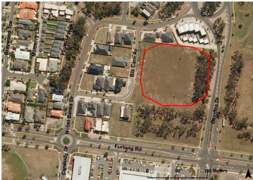
Map 1: Aerial photograph of Albion Bill Carn Avenue Grassland, Cairnlea.

Below is a map of the grassland in your neighbourhood: Albion Bill Carn Avenue Grassland, in Cairnlea. Take a minute or so to think about this area.