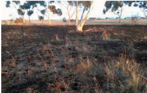
Photo 6: A few days after a planned burn at Truganina Cemetery grassland, Truganina.