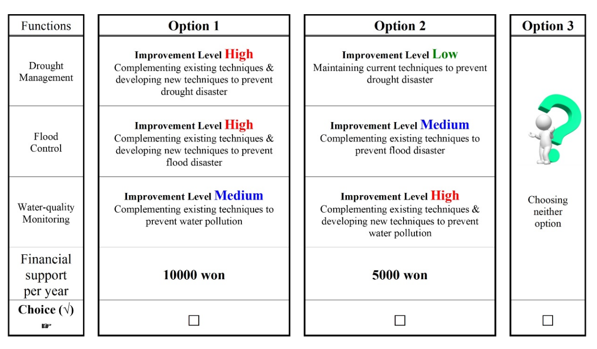
Figure 2. An example of choice set.