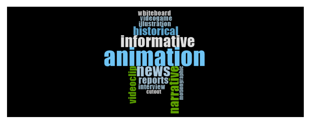
Figure 6. Types of educational videos from "Teachers vs. COVID-19" project.

initial training of teachers in Didactics of Social Sciences from the approach of relevant social problems during lockdown.