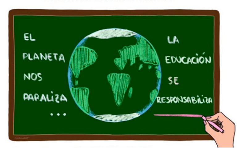
Figure 1. Visual identity of the project "Teachers Versus COVID-19": Our planet stops, Education takes responsibility (El planeta nos paraliza, la Educación se responsabiliza).

The teaching of the social sciences curriculum was considered for the creation of the content from the perspective of relevant social problems and the commitment to incorporate the Sustainable Development Goals. Focusing on relevant social problems [14–18] it helps students to take an active role in building the future and to be committed both socially and politically [19]. In addition, it also induces the students to develop critical thinking [19] through teaching-learning processes of social sciences which promote the ability to critically assess their environment both locally and globally. Here, the relevant social issue established as the starting point was the COVID-19 pandemic context. This way, the importance of including curricular contents that are adapted to the circumstances and facilitate the students' understanding of the reality lived during lockdown was emphasized. An approach that had already been considered as good practice within the "School's Out, But Class's On" campaign of the Chinese education system that proposes to: