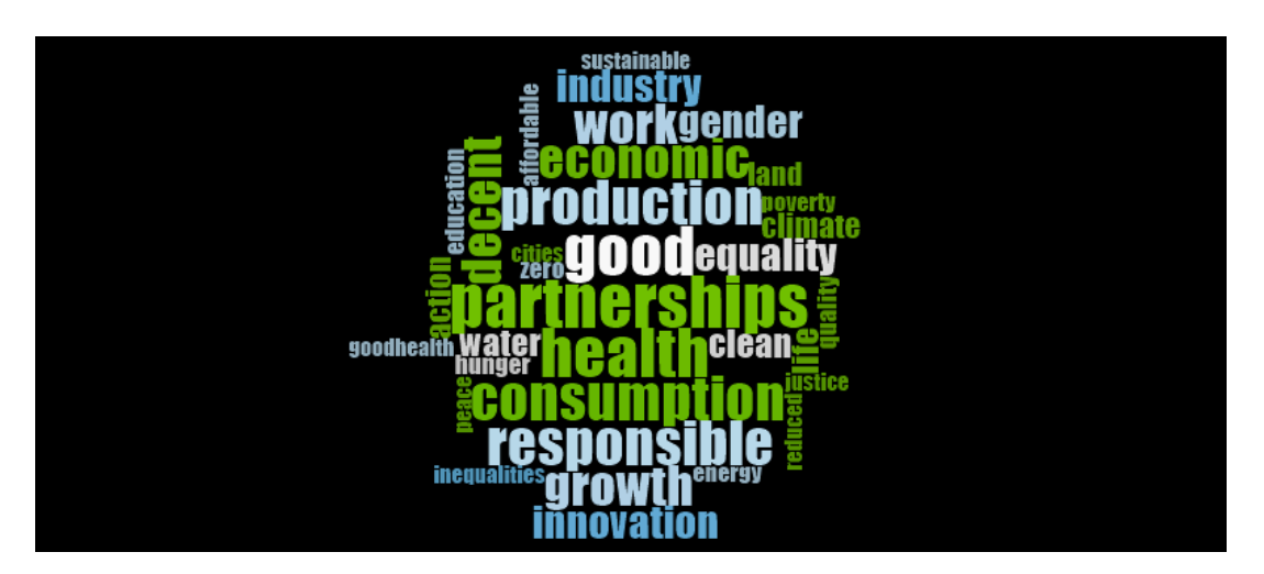
Figure 5. Sustainable Development Goals tackled in the project's educational videos.

Less impact: clean water and sanitation and zero hunger (13.5%); quality education, end of poverty, affordable and non-polluting energy and reducing inequalities (10.8%); and sustainable cities and communities and underwater life (8%).