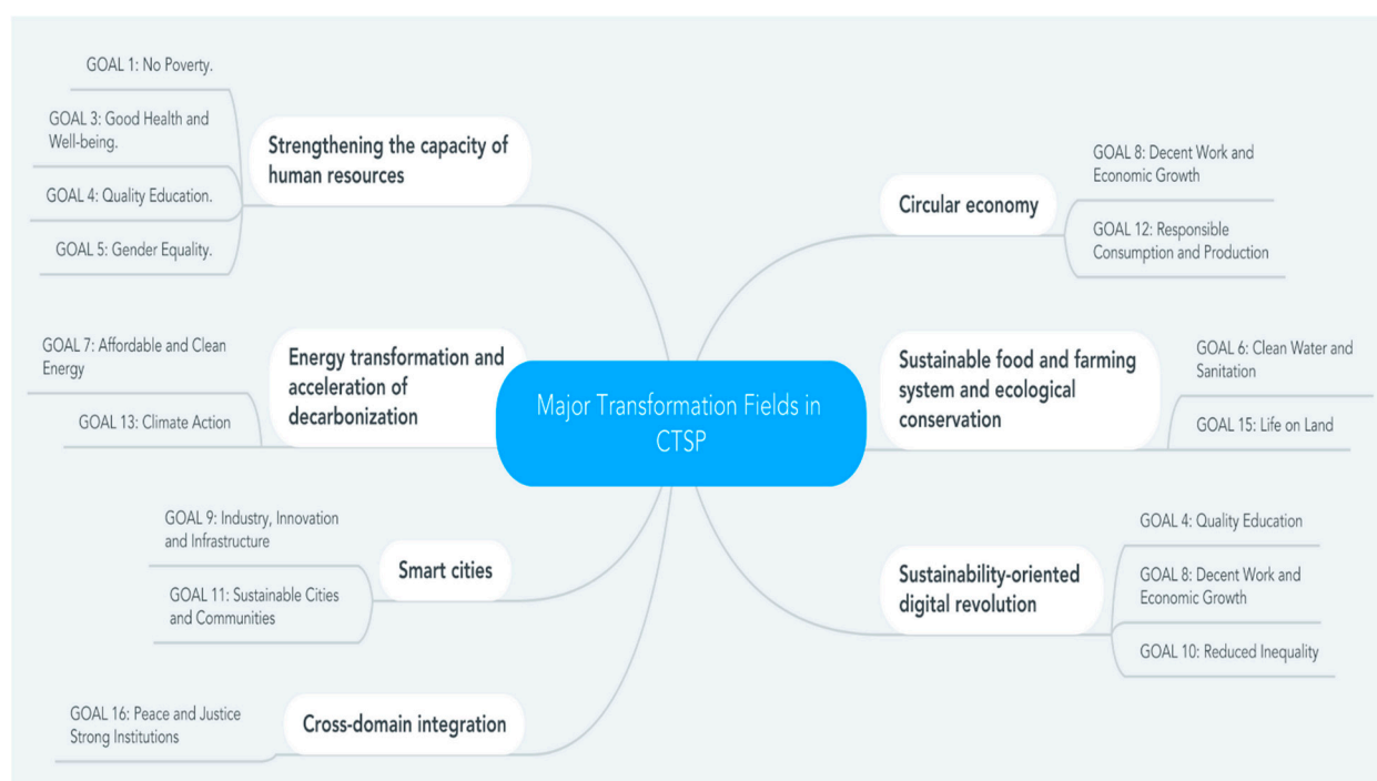
Figure 2. Major Transformation Fields in the Central Taiwan Science Park (CTSP).

while the negative effect is “doubts about environmental pollution”, which result in a lack of integration with localities. The impact of science-based enterprises in the park on environmental quality is inseparable from its long-term contribution to economic growth and employment rate.