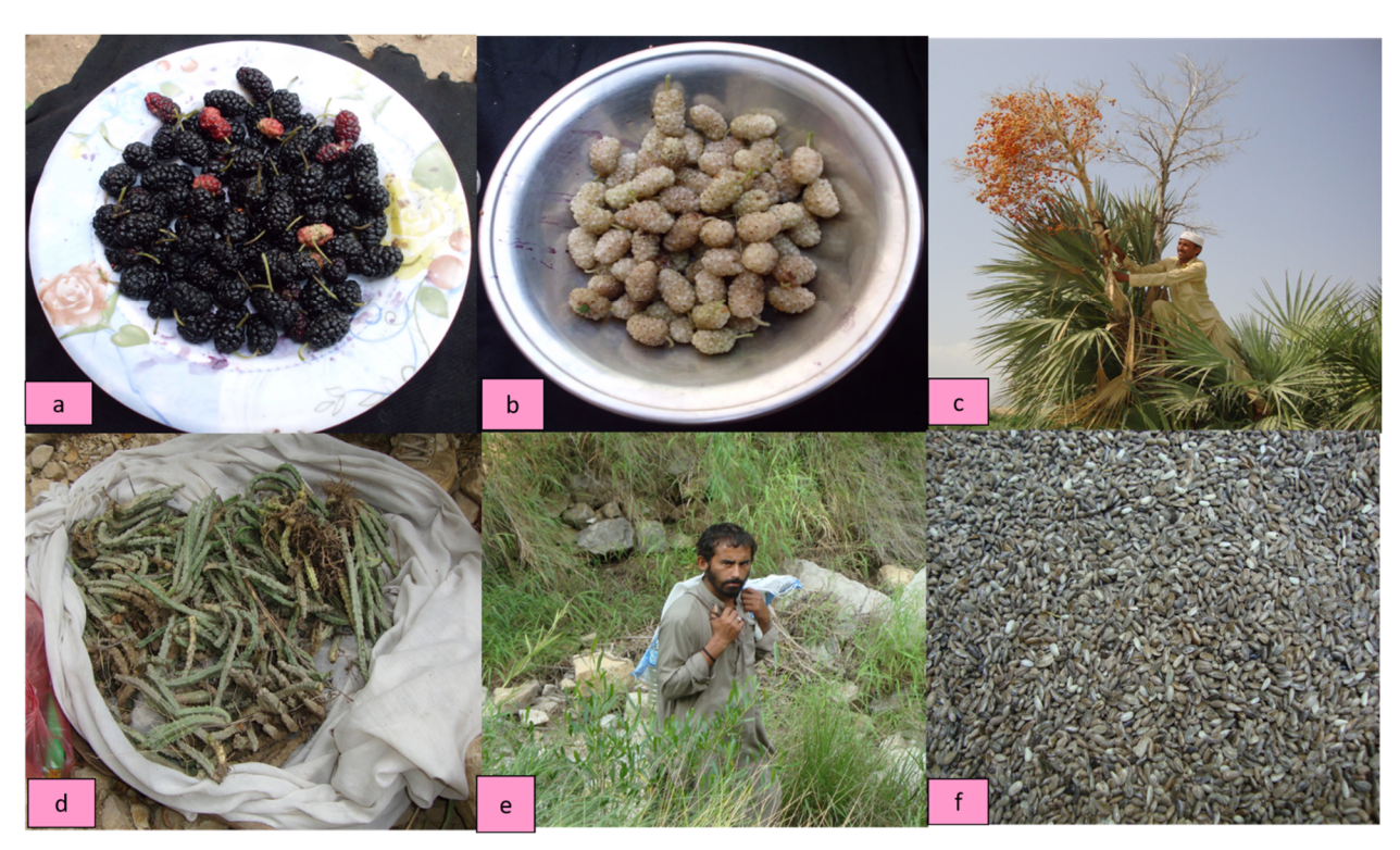
Figure 3. (a) Fruit of Morus nigra , (b) Fruit of Morus alba , (c) a young man collecting fruit of Mazri Palm, (d) Caralluma tuberculata , (e) a young man collecting different wild vegetables, and (f) Seeds of Carthamus oxyacantha .

Inhabitants of rural areas collect and sell WFPs in the local markets for income generation. Abbasi et al. [25] reported that Dryopteris ramosa , Bauhinia variegata , Chenopodium album , Portulaca quardifida , Nasturtium officinale , Malva parviflora , and Solanum nigrum are sold in the markets of Rawalpindi and Abbottabad, while we did not report the market value for any of these species. According to the findings of Abbas et al. [22], wild vegetable species available in the local markets of Kurram district include Caralluma tuberculata , Mentha spicata , Lepidium draba , Rumex dentatus , Portulaca oleracea , Malva neglecta , Trifolium repens , Stellaria media , and Nasturtium officinale . In the current study, we documented Caralluma tuberculate (Figure 3), Malva neglecta , and Mentha species, which is similar between the two study areas. Rumex dentatus , Malva neglecta , Trifolium repens , Stellaria media , and Nasturtium officinale were very common species and used by tribal communities as vegetables, but we did not observe them in the markets.