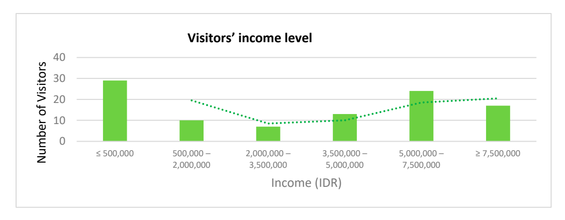
Figure 3. Graphic of visitors' income level.

The income level of visitors varies from the lowest to the highest segment (Figure 3). Theoretically, the level of visitor income will affect expenses during tourist visits. The allocation of expenditures includes transportation, consumption, accommodation, and other costs. Income is also expected to influence the choice of tourism objects to be visited. These data are consistent with the occupation type data, where most visitors are students. Students do not have income at that age, and are still supported by their parents, including budget allocations for tourism purposes.