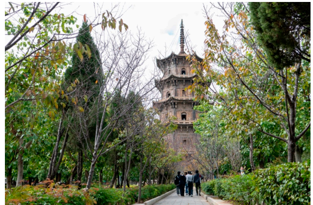
The Renshou Tower