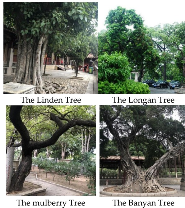
Figure A2. Plant landscape in Kaiyuan Temple.