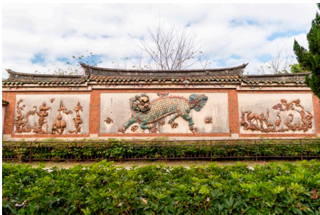
Porcelain carving and relief art