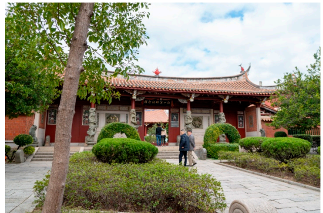
The Hongyi Master Memorial Hall