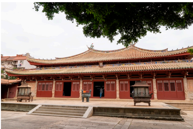
The Dacheng Hall