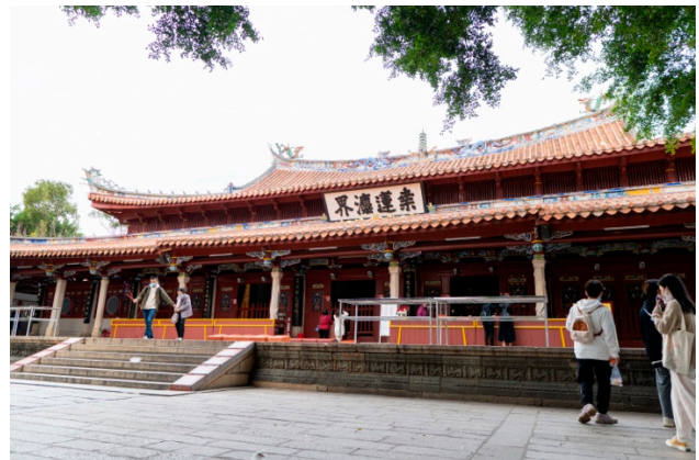
The Daxiong Hall