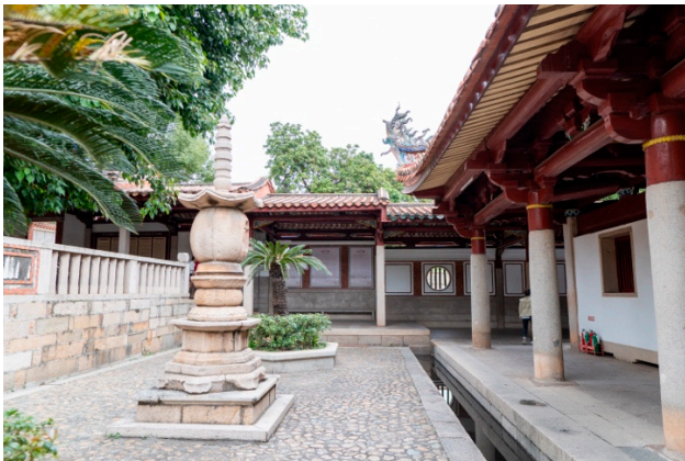
The Temple Space