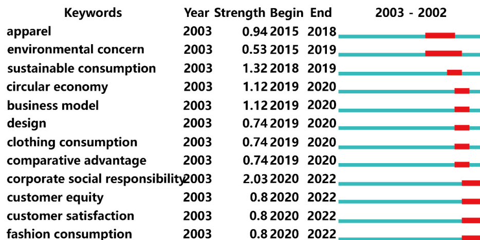
Figure 2. Keyword emergence analysis of the 165 pieces of literature related to sustainable merchandising of apparel.

The analysis of the 12 emergent keywords of the literature on sustainable merchandising of clothing in Figure 2 shows that, among the keywords of the literature on sustainable merchandising of clothing, the initial year in which the term “apparel” was mentioned was 2015. After 2018, the term is rarely mentioned in the keywords of the literature related to sustainable merchandising of apparel. The terms “circular economy”, “business model”, “design”, “clothing consumption”, and “comparative advantage” emerge as key buzzwords in the literature on sustainable merchandising of clothing between 2019 and 2020. This also indicates that “circular economy”, “business model”, “design”, “clothing consumption”, and “comparative advantage” will be the key focus of researchers in 2019–2020. According to the chart below, “corporate social responsibility”, “customer equity”, “customer satisfaction”, and “fashion consumption” will be the emerging words in 2020–2022, and the above four research themes will become the new research themes.