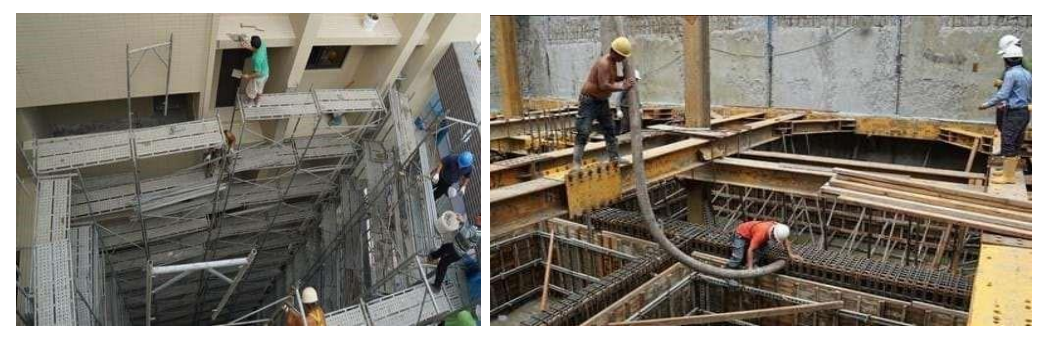
Workers in aloft activities without any<br/>protectionWorkers in unsafe positions without any<br/>protection

for on-site investigation and data collection at the sites, including a major incinerator construction project. During the observation period of over 2 years, the supervisors and occupational safety and health personnel in charge of each area of the site carried out daily inspections to investigate and compile records of errors and violations in accordance with the laws and regulations. These are the Occupational Safety and Health Law, the Occupational Safety and Health Facilities Regulations, the Occupational Safety and Health Facilities Standards, and other related regulations promulgated by the Ministry of Labor Affairs.