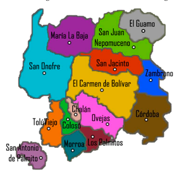
Figure 3. Colombia: Bolivar.

In Bolivar (Colombia) (Figure 3), the three selected communities were directly affected by the conflict between paramilitaries ( paracos ) and the FARC guerrilla. The project took place in the post-conflict context of Bolivar following the peace agreement between the Colombian government and the FARC rebel group, which was announced in late 2016.