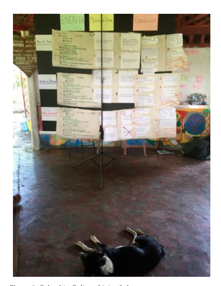
Figure 5. Colombia: Bolivar. Living Lab outcome.