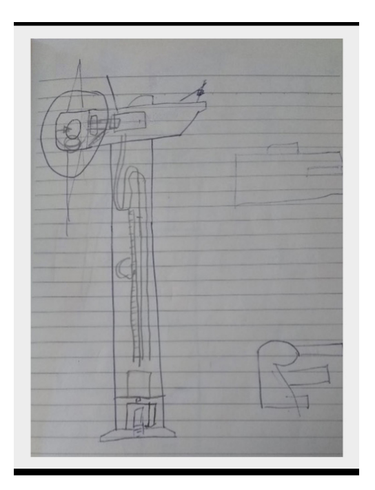
Figure 1. Graphic representation of a wind turbine with "critical points" drawn by the O&M technicians in the context of the collective interviews.

Beyond the "activity diary", the exploration of the drawings as a data collection technique in this context underpinned a heuristic approach in conducting this case study. The purpose of using the graphic representation of a wind turbine developed by workers themselves was to constitute it as a "common place" for dialogue within the workers' collective on dimensions of the activity that could not be observed continuously over time (the analysis of risks in situ), nor would they be spontaneously verbalized in the absence of this symbolic reference to their work situation [40]. Furthermore, the request for the representation of a wind turbine was not intended to be a faithful representation of their workspace but rather to serve as a mediating tool to explain the details concerning critical points of the work activity, namely, local specificities to be considered in the risk evaluation, reinforcing the centrality of certain areas to how those risks are expressed [40,41]. The identification of risk factors using this graphic representation was, firstly, based on the workers' point of view, which was then complemented with other dimensions of analysis, stemming from the data collected.