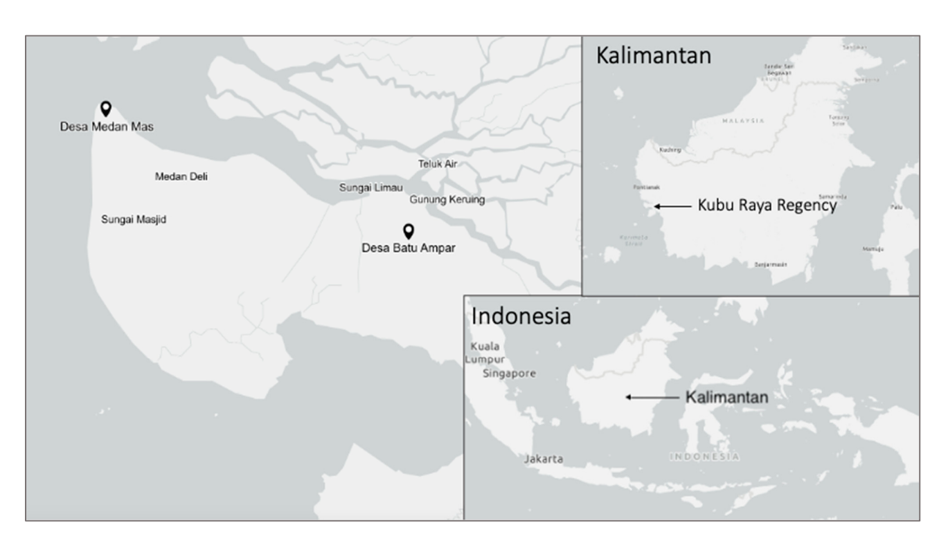
Figure 1. Map of Indonesia ( bottom right ), map of Kalimantan ( top right ), and map of Batu Ampar and Medan Mas villages located in Kubu Raya Regency.