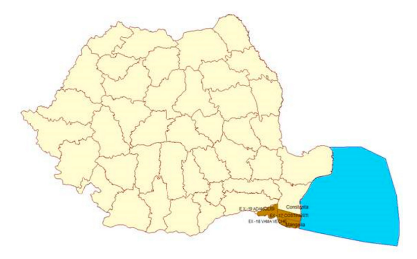
Figure 3. Location of respective areas EX—19, EX—18 and EX—17. Source: [1].

The three perimeters affected by this declassification are EX 19 Adamclisi, EX—18 VamaVeche and EX—17 Costinesti located in the south-east of the country (as in Figure 3), being delimited to the east by the Black Sea and the border between Bulgaria and Romania. From the administrative point of view these perimeters are located in Constanta County.