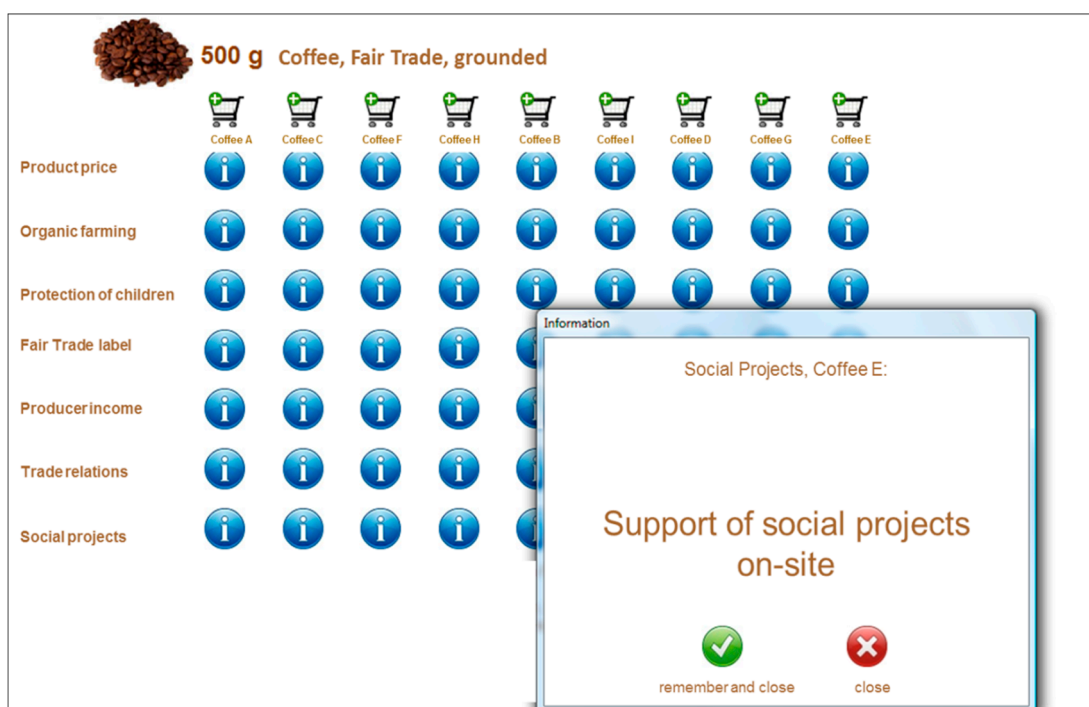
Figure 2. Screenshot of IDM with opened field.

The IDM method has several advantages compared to direct inquiries when the objective is to elaborate information search behavior. The application of the IDM minimizes the bias between actual and indicated behavior [30,31] due to the interaction with a computer instead of a person. Inquiries on ethical consumption are especially sensitive to misreporting due to a social desirability bias. Moreover,