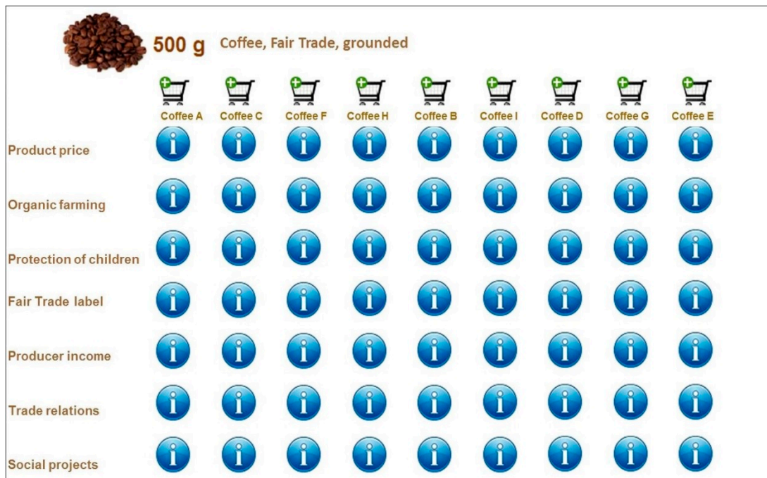
Figure 1. Screenshot of IDM.

The graphic information was subsequently assigned to information search strategies which were described by e.g., Payne et al. [25].