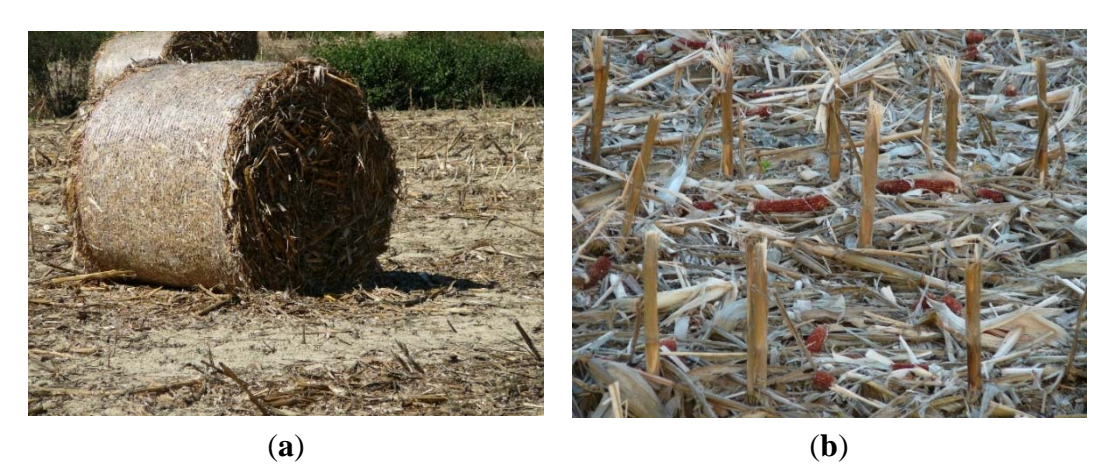
Figure 3. ( a ) The removal of residues (here corn stover) leave the soil uncovered and at the mercy of the weather which quickly degrade it; ( b ) crop residues left on the soil guarantee soil protection against the effect of the weather, supply nutrition elements and help to preserve soil biodiversity and soil health.

• the greater availability of crop residues and weed seeds translates to increased food supplies both for invertebrates and vertebrates, which play important ecological functions in agro-ecosystems, influencing, among other things: soil structure, nutrients cycling and water content, and the resistance and resilience against environmental stress and disturbance [57,115–120].