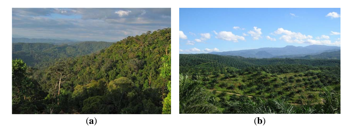
Figure 2. The effects of land use change in tropical ecosystems ( a ) tropical forest; ( b ) palm oil plantation in Indonesia.