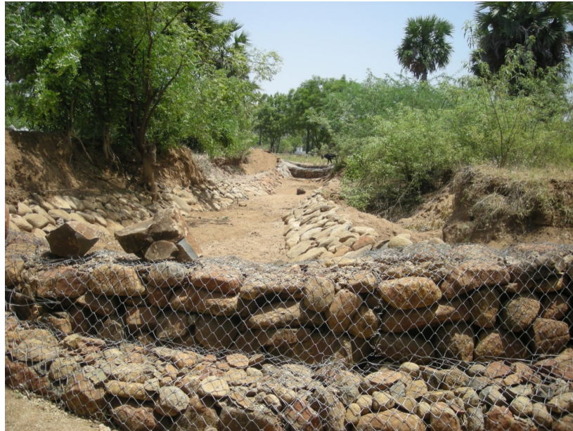
Figure 4. Stone pitching and stepped gabion for gully control in Telengana.

Other structures are: gully checks with loose boulder walls and sand bag structures. Gabions are wire-mesh baskets filled with stones (Figure 4). The wire-mesh holds the stones together and keeps them in place when the structure is subject to pressure. Gabions are effective at absorbing the kinetic energy of running water. A gabion is a semi-rigid, bulky mass, which is difficult for water to move. A row of linked gabions is fairly rigid and responds well to the terrain. These structures are used as checks in waterways and gullies.