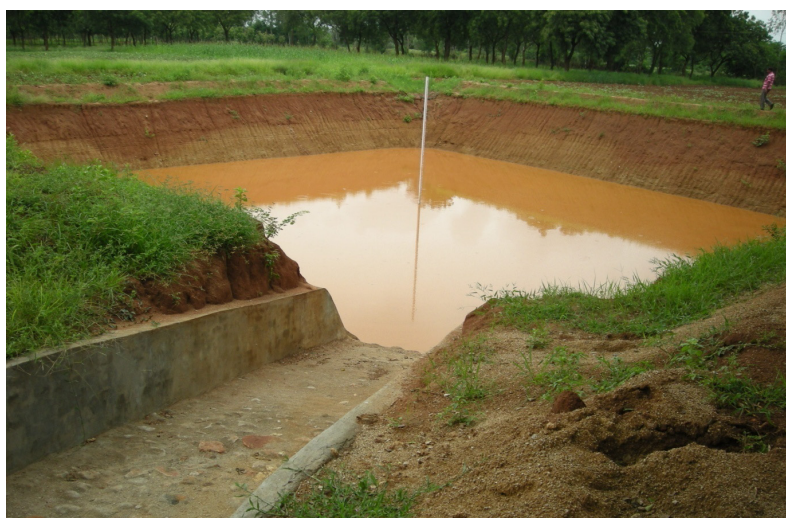
Figure 3. Farm pond for rain-water harvesting in Telengana, India.

Some promising community-based soil conservation measures are: masonry check dams [124], low-cost earthen check dams and farm ponds (Figure 3). Water harvesting in these structures increases ground-water levels. Additional water resources are thus available to farmers in providing supplemental irrigation to crops (e.g., chickpeas or vegetables), especially after the rainy season. In most semi-arid tropical areas, farm ponds are usually unlined and therefore, much water is lost through seepage. On Vertisols, there is generally no need to line ponds, as seepage losses are usually low, mainly due to the very low saturated hydraulic conductivity in the range of 0.3–1.2 mm·hour −1 [125].