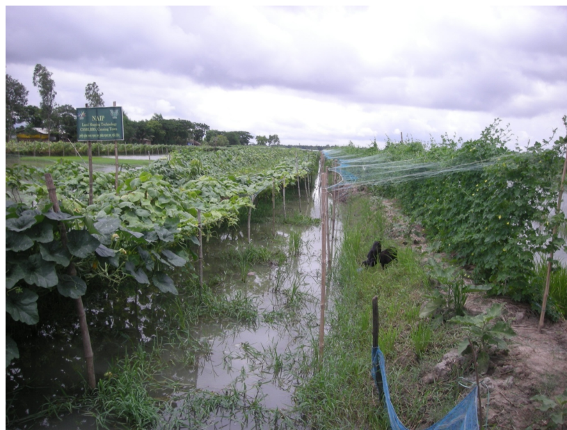
Figure 7. Deep furrow and high ridge technology at farmer's field in the Gangetic coastal region of West Bengal.

Deep furrow and high ridge: About 50% of farm land is shaped into alternate ridges (1.5 m top width \times 1.0 m height \times 3 m bottom width) and furrows (3 m top width \times 1.5 m bottom width \times 1.0 m depth). These ridges remain free of water-logging during the kharif season, with less soil salinity accumulation in dry seasons (due to higher elevation and the presence of fresh rain-water in furrows). The remaining farmland, including the furrows, is used for growing more profitable paddy and fish cultivation in the kharif season. The rain-water harvested in furrows is used for irrigation (Figure 7).