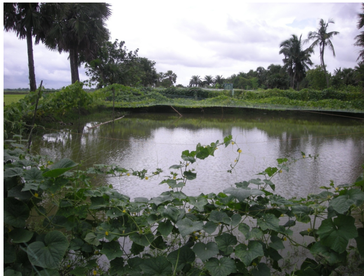
Figure 6. Farm pond technology in farmer's field in the Gangetic coastal region of West Bengal.

Deep furrow and high ridge: About 50% of farm land is shaped into alternate ridges (1.5 m top width \times 1.0 m height \times 3 m bottom width) and furrows (3 m top width \times 1.5 m bottom width \times 1.0 m depth). These ridges remain free of water-logging during the kharif season, with less soil salinity accumulation in dry seasons (due to higher elevation and the presence of fresh rain-water in furrows). The remaining farmland, including the furrows, is used for growing more profitable paddy and fish cultivation in the kharif season. The rain-water harvested in furrows is used for irrigation (Figure 7).