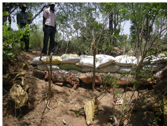
Figure 5. Sand bag structure for gully control in Telengana.

Sand bag structures are inexpensive temporary gully control structures made of empty fertilizers/cement bags filled with sand (Figure 5). They are mostly used in upper reaches of small gullies with relatively low runoff discharge and ample available sand. The empty cement bags are filled with sand and piled one above the other in rows, thus in-filling the gully. Whenever the sand bags are damaged they are replaced. Structures can be strengthened using a bio-energy approach, by supporting it with vegetation ( Gliricidia ) on the downstream side.