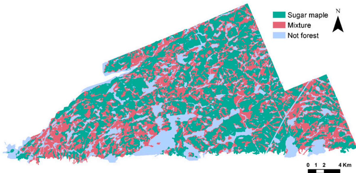
Fig. S.1 Forest type map of a portion of Haliburton Forest and Wildlife Reserve. The green regions are classified as predominantly sugar maple whilst the red regions are classified as a mixture of conifers and broadleaves. The blue regions are not forested and include lakes and major roads.

The forest was classified into two forest types from aerial photographs: predominantly sugar maple or a mixture including a significant coniferous component. Fig. S.1 presents a map of the spatial distribution of these two forest types.