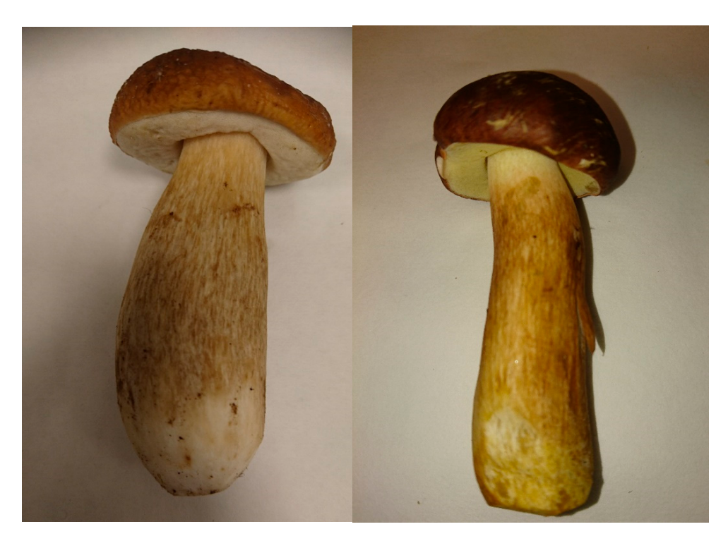
Figure 1. Boletus edulis (left) and Xerocomus badius (right).

source of nutrition, thus wild-growing species are gaining steady popularity as commercial products, increasingly appreciated as a delicacy. Mushrooms are a good source of digestible proteins and fiber, are low in fat and energy, and offer a beneficial combination of vitamins and minerals in harmonious proportion [3].