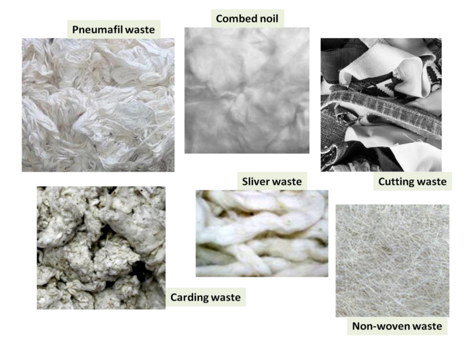
Figure 3. Examples of waste originated by textile world.

According to the study on textile waste lifecycle by Domina and Koch [42], all these different forms of solid waste, coming from fabric and apparel, can be grouped into two broad categories: one concerns the unsold merchandise and pre-consumer waste generated by retail that can be easily re-integrated through outlet, jobber, or non-profit organizations; another regards the post-consumer waste of fiber (yarn, fabric scraps, and apparel cuttings) generated by fiber producers, textile mills, fabric, and apparel manufacturers. For these latter, there are three possible disposal routes: (i) to be stored in the landfills, (ii) to be burned in incinerators in order to be converted into energy or powder, or (iii) to be sold to a textile waste recycler and re-converted into reusable goods.