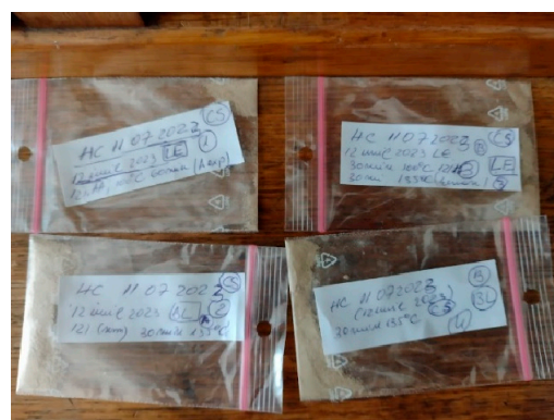
Figure S4. Hemicelluloses samples (before and after drying).