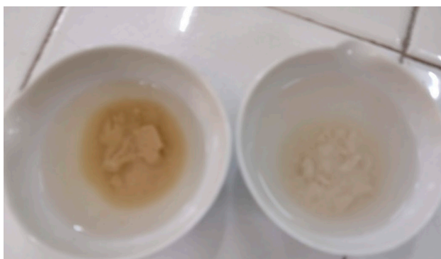
Figure S3. Various stages of liquid phase processing.