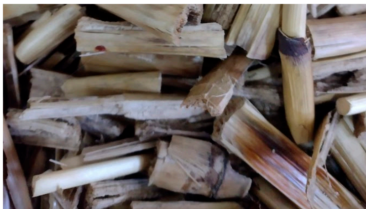
Figure S1. Corn stalks chopped and shredded.