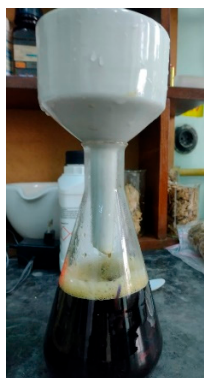
Fines removal (filtering)