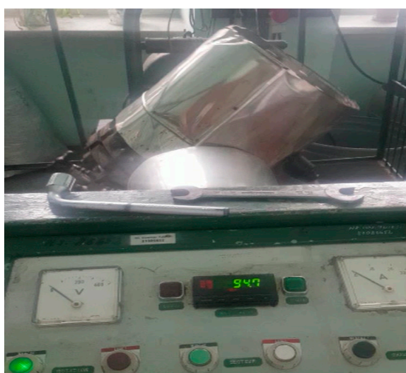
Figure S2. The pulping reactor.