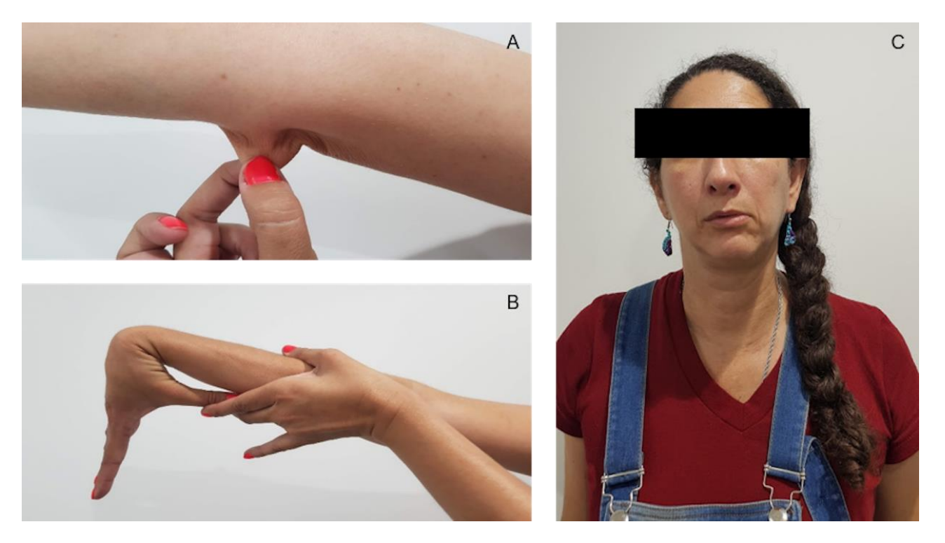
Figure 2. Clinical features of the patient. ( A ) Hyperextensibility of the skin. ( B ) Passive apposition of the thumbs to the flexor aspects of the forearms. ( C ) Mandibular deviation to the left.