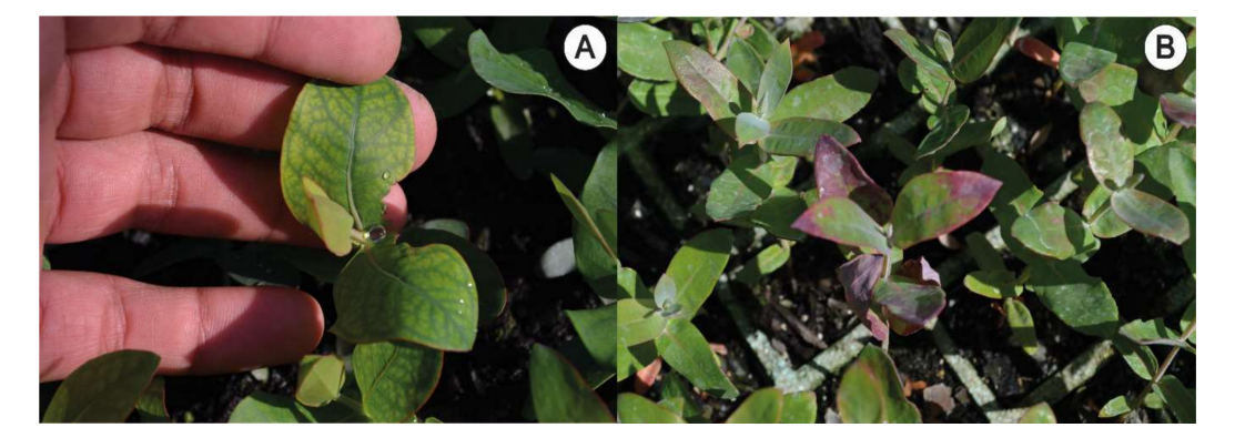
Figure 2. Deficiency symptoms of magnesium in Eucalyptus nitens ( A ) and phosphorus in Eucalyptus globulus ( B ) detected during the 2014–2015 growing season at nurseries in the Biobío region.

specifically formulated for use on Chilean agricultural soils, not soilless media. These fertilizers have low concentrations of magnesium and sulfur (less than 1%) and almost no calcium. Therefore, it is common to observe deficiencies in these elements (Figure 2).