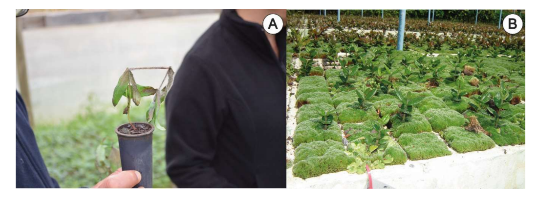
Figure 3. ( A ) Incidence on Botrytis cinerea on Eucalyptus globulus plants; ( B ) moss growth on the speedling surface due to excessive irrigation.