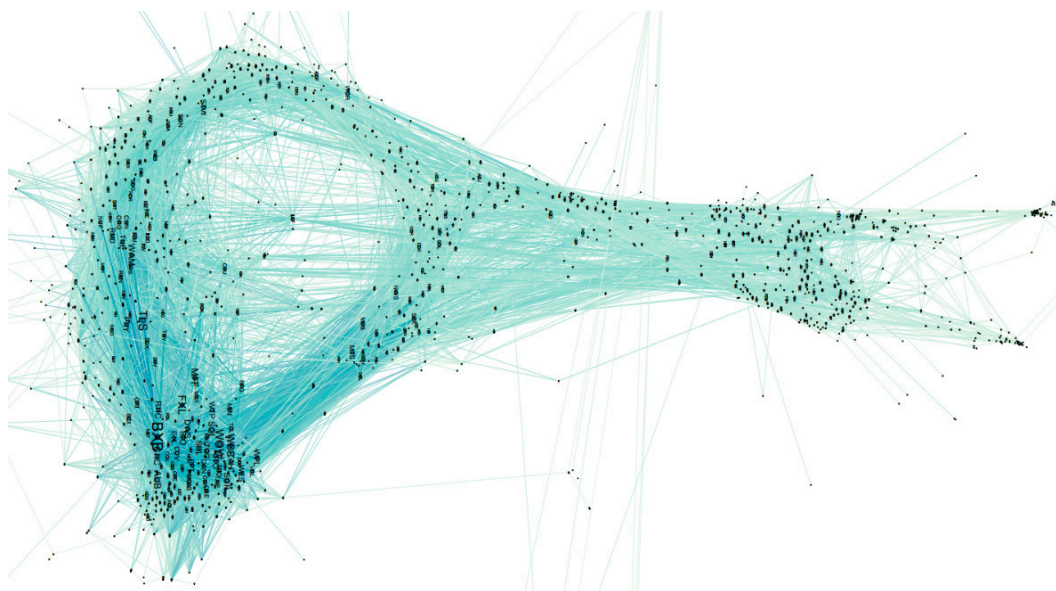
Figure 3. An overview of the Australian stock market ( |E| = 1379 ; |V| = 11,535 ; weighted degree metrics applied).

Figure 3 offers an overview of the entire Australian stock market network based on shares cleansed in this study, which includes 1379 stocks and 11,535 connections among them. Some peripheral vertices may not be shown in Figure 3 due to the paper layout size limit. Figure 3 applies the weighted degree centrality measurement for computing the ranking of each share, the darker colour and larger node name indicate significant (higher ranking) stocks, and the thicker edge width represents stronger connections between two shares.