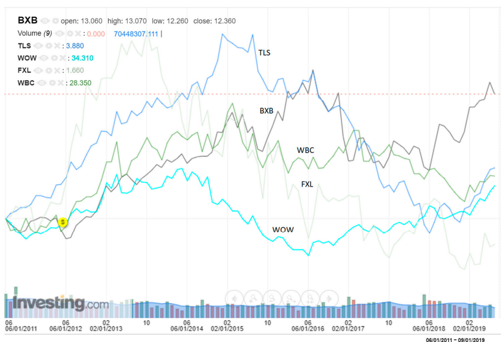
Figure 4. An example of a traditional chart for showing five stocks' price changing trends (from https://www.investing.com/charts/real-time-stocks-charts ).

In the stock market, there are drawbacks of traditional data analysis methods. For example, stock charts can only present selected shares in limited amounts (see Figure 4, it shows a case that only contains five stocks BXB, TLS, WOW, FXL, WBC, stock details can be referred from https://www.asx.com.au/ ); treemap's capability is restricted in a complex network, and the way of representing parallel coordinates' makes it hard to understand and show complicated datasets. Comparing to those existing works, this research combines data processing, graph visualisation and centrality metrics methods, calculates edge weights based on stocks' price changing rates, provides not only the structure of the Australian stock market network (Figure 3), but also offers a feasible way to do the 'importance' analytics among massive stocks (top rankings). Hence, the methodology could deliver significant shares and relations among them that previous studies may lack.