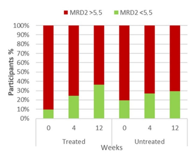
Figure 1. Lower eyelid margin reflex distance (MRD2) in treated vs. untreated patients based on physiological range ( left ) and measurement ( right ).

During the 12-week treatment, there was a significant reduction in the MRD2 measurement in the treated group from an initial median of 7 mm (IQR 6.8–8) down to 6 mm (5–7) at the end of the study, with the change being significant (Friedman test, p < 0.0001; Table 2, Figure 1). In the untreated group there was no perceptible change, with the median measurement starting at 7 and remaining at 7 mm (Friedman test, p = 0.1939; Table 2, Figure 1).