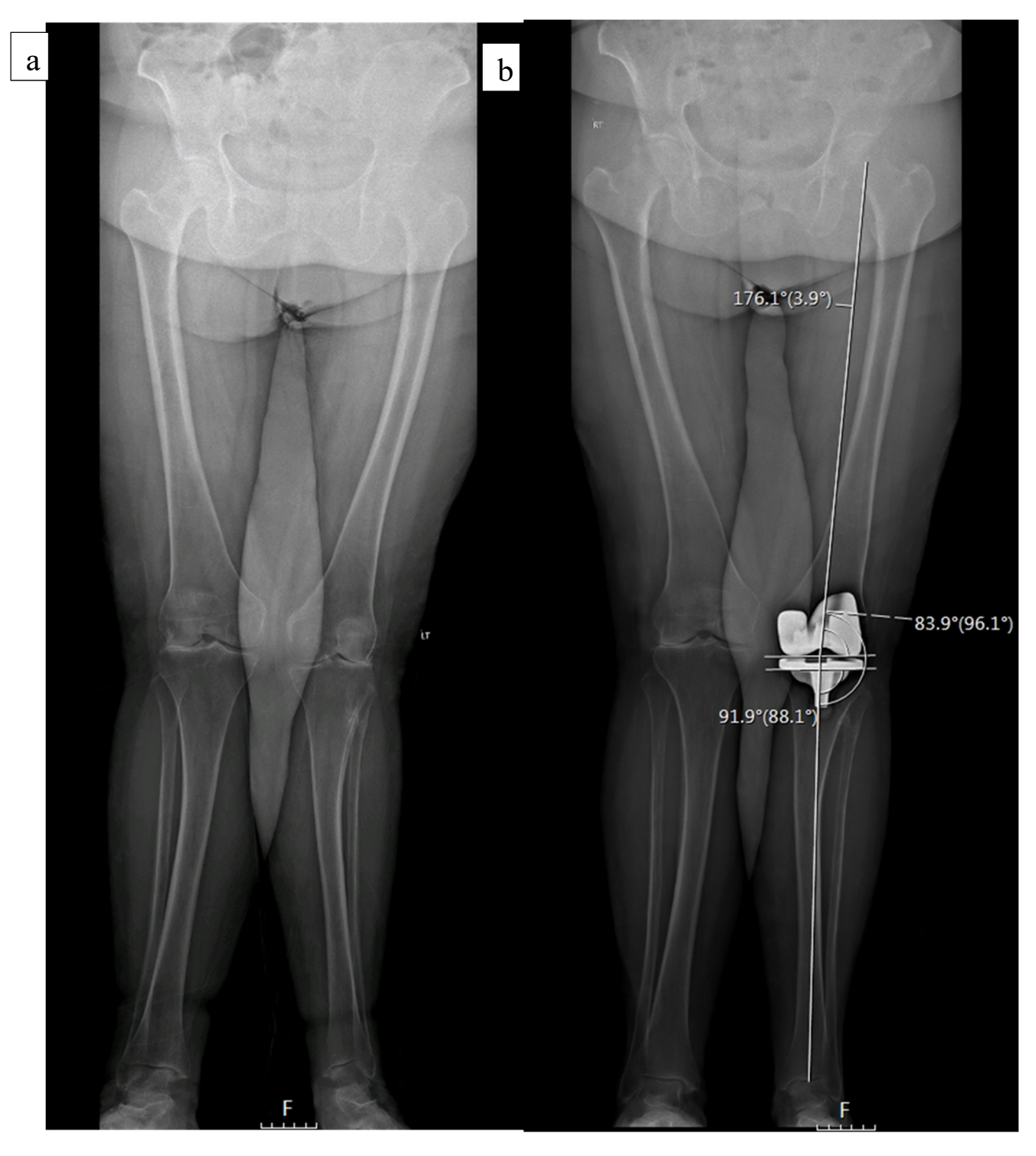
Figure 1. A 76-year-old female with a preoperative valgus alignment ( a ). Postoperative radiographic analysis shows a MPTA of 88.1°, LDFA of 83.9°, and HKA of 3.9° ( b ).