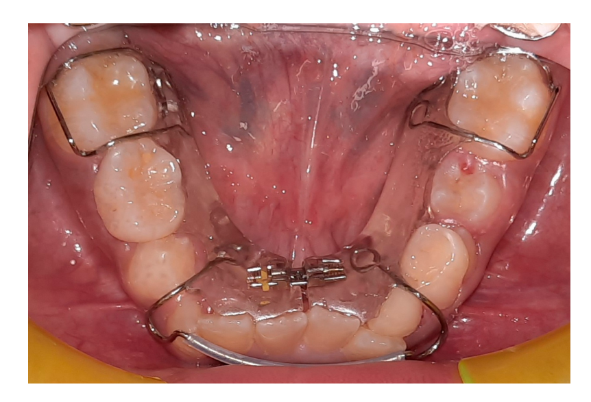
Figure 3. Schwarz's appliance.