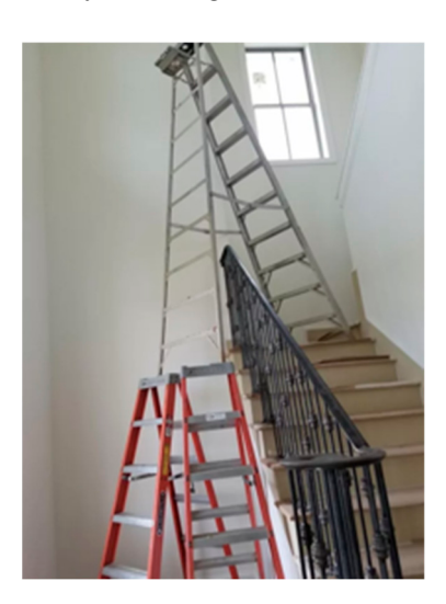
Figure 5. Viral epic fail example (health and safety fails from around the globe) [51].

disaster. The photograph has also been made visible across the network and distributed widely, reaching an international audience.