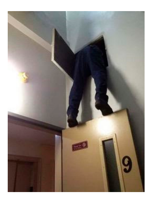
Figure 4. Viral epic fail example [48].