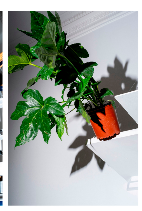
Figure 6. Untitled from Cutting Corners by Philip Welding.