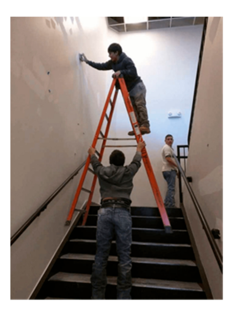
Figure 3. Epic fail example (Metro newspaper article, 'When Health and Safety Went Out of the Window') [47].