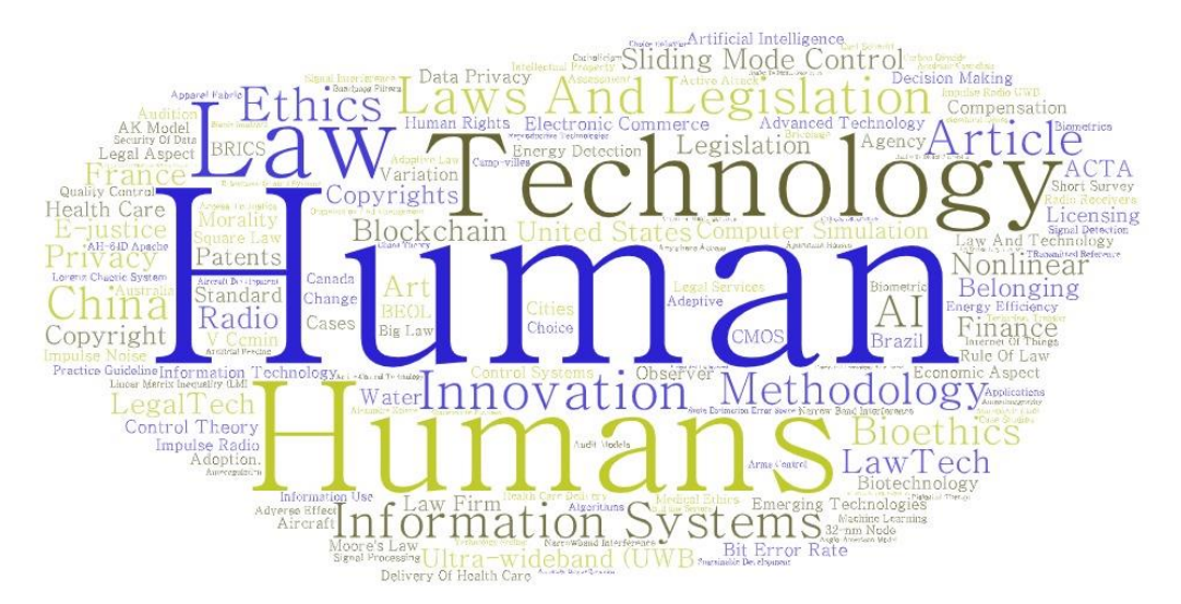
Figure 1. Cloudword of keywords in Lawtech.

Legal Services, Legal System, or Access to Justice. As an important and shared keyword related to both terms, the following is Laws and Legislation.