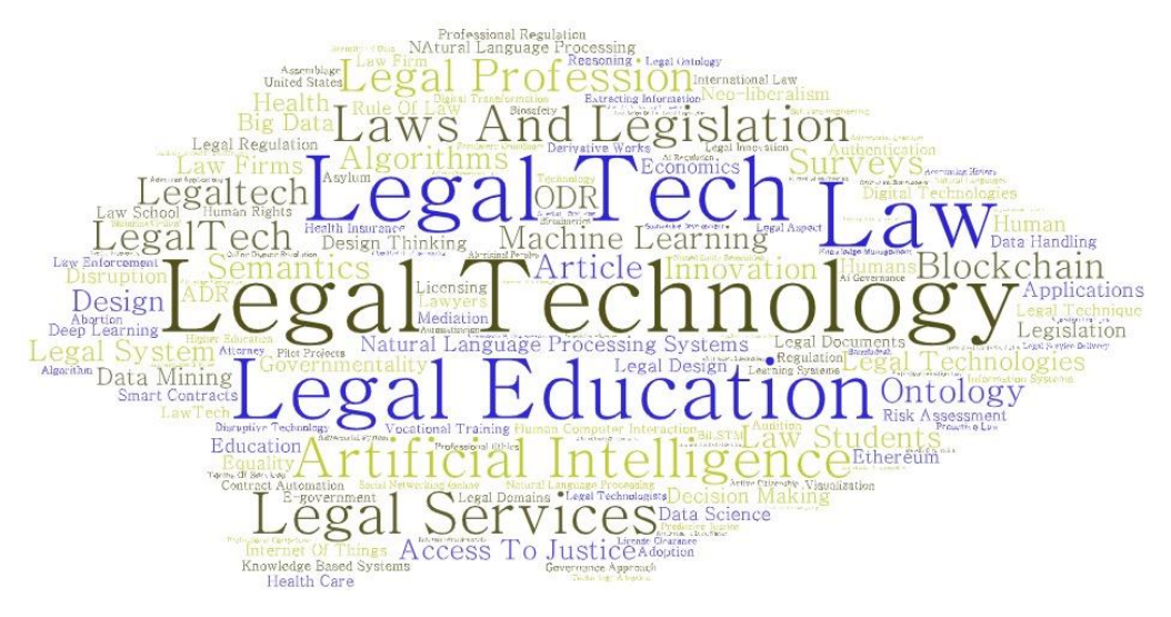
Figure 2. Cloudword of keywords in Legaltech.

In a more detailed analysis of these keywords in the two previous figures, Table 2 is obtained. In this Table 2 the top 10 keywords appearing in the cited documents are listed, in which the search terms (Legaltech and Lawtech) have been excluded.