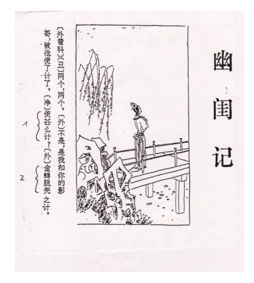
Figure 3. A dialogue in the Drama Report on a Lonely Woman's Chamber: [1] "Which stratagem?"; [2] "The cicada casts off of its skin of gleaming gold".

In the drama Report on a Lonely Woman's Chamber (see Figure 3) by Shi Hui from the Yuan Dynasty (1271–1368), the war cloak of the persecuted son of a high dignitary who has just been killed by imperial order lies next to a well shaft. The two captors initially think that the son had thrown himself into the well and thus taken his life. Then, one of the captors says: "We've been taken in by a stratagem."—"Which stratagem?"—"The stratagem «The cicada casts off of its skin of gleaming gold». He tricked us into looking for his body here. In the meantime, he's long gone" (Sheng 2006).