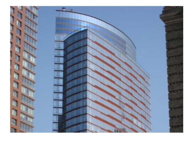
Figure 6. The Visionaire [30].

The Visionaire's PV custom-made panels (see Figure 6) act as a full cladding system, incorporating a ventilated cavity to avoid heat build up and loss of PV efficiency. The panels represent an example of learn by doing, gathering from the Solaire's experience where the direct contact of the insulation to the PV glass generates heat build up, and incorporating the technological improvements in the building design process. In the Visionaire, the architects maintain the PV panels flush with the façade. In doing so, however, they rely on a fixed building configuration and show, as in the Solaire, the domestication of PV to an aesthetic and constructional role.