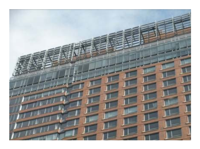
Figure 8. The Riverhouse dynamic PV system [28].