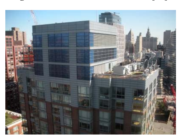
Figure 4. The Verdesian's bulkhead [28].