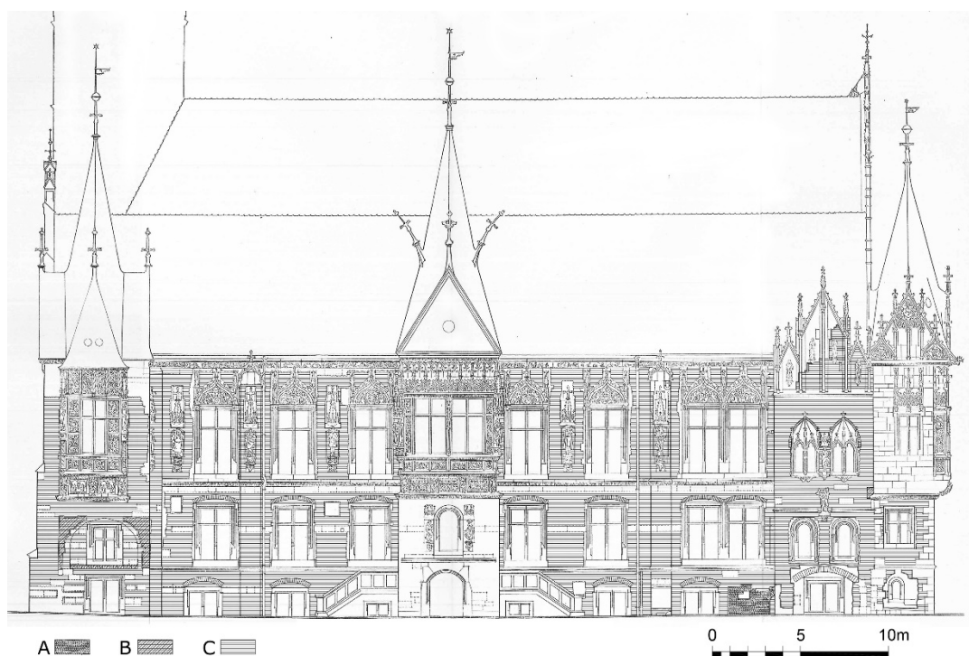
Figure 3. Wrocław Town Hall, southern façade with chronological stratification of its walls: (A) eastern part of the southern part of the Town Hall with the eastern avant-corps (first phase of constructing the façade from around 1330)–dismantled wall; (B) western part of the southern part of the Town Hall with the western avant-corps (second phase of constructing the façade from the period after 1330); (C) reconstruction of the southern façade with the central and western avant-corps (third phase of constructing the façade from 1471–1486), created by the authors—adapted a drawing from (Bukowski and Zlat 1958, drawing 11).

The oldest walls within the southern part of the building, which later underwent a Gothic reconstruction in 1471–1486, were erected during two construction actions (Figure 3). They are located on the edges of the present southern façade. The building in the eastern part of the complex was erected first. It was built as a single-nave building arranged along the east–west axis and adjacent to the east part of the Town Hall’s extension, which was built in around 1330 (Czerner and Lasota 1999, pp. 14–18; Czerner 2002, pp. 89–91). This building consisted of a two-span nave and a diagonally placed avant-corps in the south-eastern corner of the present Town Hall. The remains of the avant-corps include fragments of a dismantled wall with dimensions of approximately 1.70 m/2.80 m, which were found at the height of the present most outer eastern window of the basement.