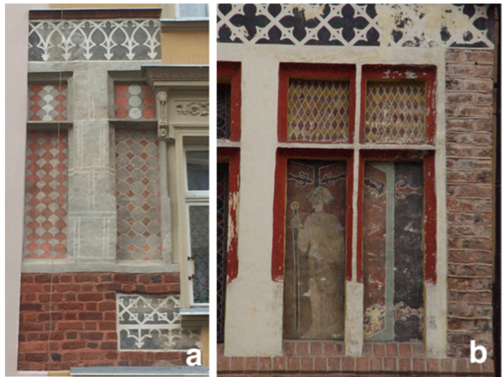
Figure 12. (a) Fragment of the medieval decoration of the tenement house at Dzierżonia Street in Brzeg; (b) fragment of decorations from the southern façade of the Town Hall in Środa Śląska.

Conservation works on the southern façade of the Town Hall, which were carried out in the second half of the nineteenth and early twentieth centuries, were conducted during three renovations managed by: Lüdecke in the years 1884–1891 (Lüdecke 1898), Stein between 1934 and 1939 (Stein 1935), and Bukowski during the post-war reconstruction carried out in the period between 1949 and 1953 (Bukowski and Zlat 1958). The works mainly included the repairing of the brick face under the crowning cornice and around the framing of window openings, as well as the supplementing or replacing of stonework elements, which mainly concerned canopy tops and the fields under the eaves in the western avant-corps. During the works carried out under the direction of Lüdecke, carved figures were placed on the consoles (representations of historical artisans). In turn, the cement plaster of the façade that has exposed stone blocks was made in 1949–1953 during works directed by Bukowski (Bukowski and Zlat 1958, pp. 73–81, 90, 101). Unfortunately, during each of these projects, no identification of the colour scheme of the stone detail and the façade was carried out. It was only Lüdecke who made an inventory of the preserved fragments of the façade decorations from around 1510 (Lüdecke 1898, drawings 6–7). This material was used by the authors as one of the sources for the conducted analyses, which were discussed above.