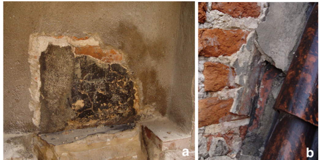
Figure 9. Wrocław Town Hall, southern façade (the second colour phase from around 1510); (a) background of the recess in the eastern span buttress; (b) remnants of plaster with traces of a painted decoration (Photos by the authors).

in the recesses between the windows of the first floor. In one of them, a fragment of a red frame was found surrounding the blende area, which was painted black, and which originally constituted the background for the figural decoration (Figure 9a). A small strip of plaster was also found above the roof of the eastern avant-corps (Figure 9b). A fragment of the lower edge of the motif painted in white was discovered there. The plaster was made of sand-lime in a pink-sand colour with visible small lumps of not fully slaked lime. The thickness of the plasters ranged from about 5 to 7 mm, and they had a slightly uneven (wavy) texture due to their surface being smoothed with a trowel (Legendziewicz and Polak 2005, p. 9).