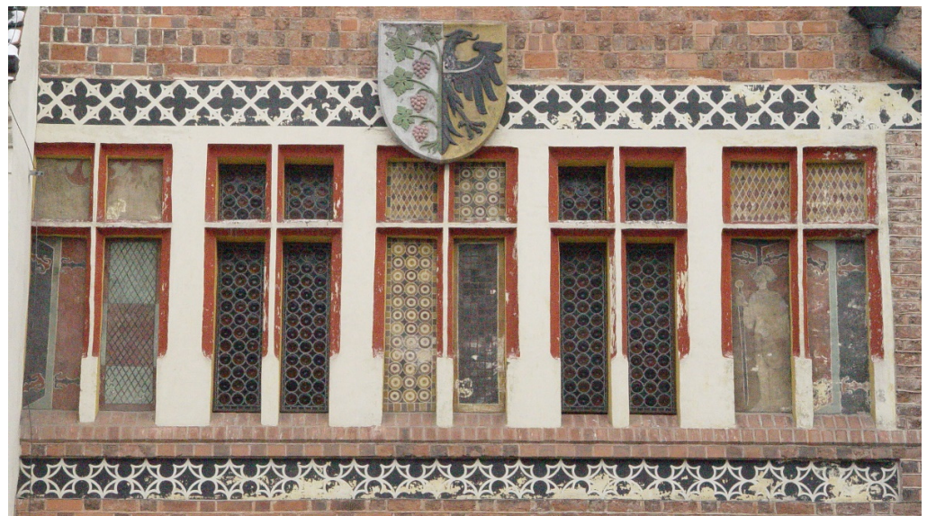
Figure 13. Medieval decor on the southern façade of Środa Śląska Town Hall, photo by the authors.

The painted decor that was completed in around 1510 should be seen in a similar way, as it also complements the rich stone decorations. It is difficult to define the influence of this decoration on the late Gothic architecture of town halls in Silesia, and we do not know of any other example of this type from the area. The medieval colour scheme was mainly monochromatic with red, black, or white. Small images of the richness of the forms and colours of the polychrome on the southern façade of Wrocław Town Hall can be seen in its remains, as well as in the preserved interior of Środa Śląska Town Hall, which is dated by historians to the turn of the 15th and 16th centuries (Figure 13) (Czerner and Kościuk 1999, Figure 4, pp. 141–49).