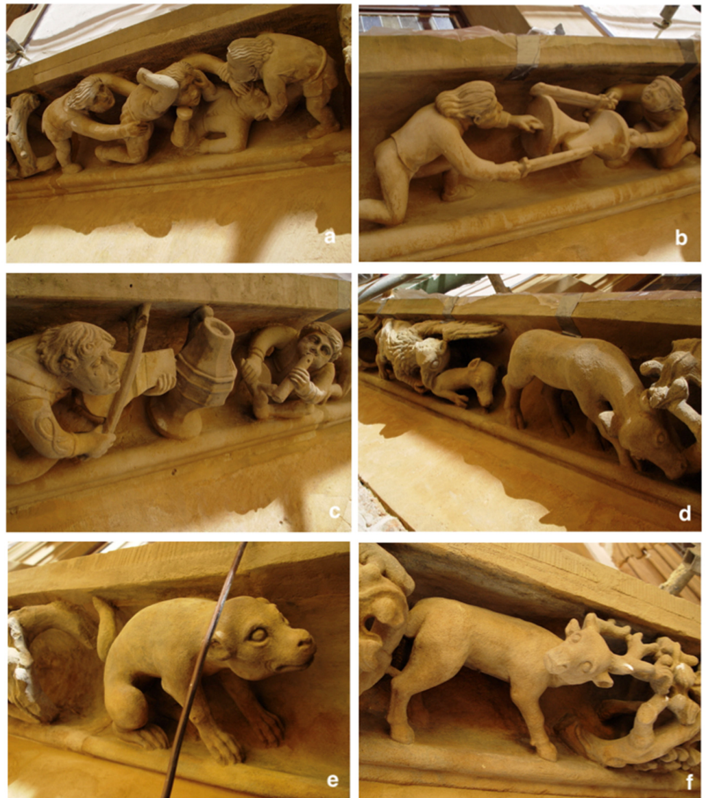
Figure 6. (a–f) Wrocław Town Hall, southern façade, sculptures on the cornice between the ground floor and the second floor: (a) a fight in an inn; (b) a duel with wooden swords; (c) musicians playing a pipe and violin; (d) a lion biting his prey; (e) a fairy-tale stork serving food to a fox in a tall jug; (f) a deer with antlers tangled in branches (Photos by the authors).