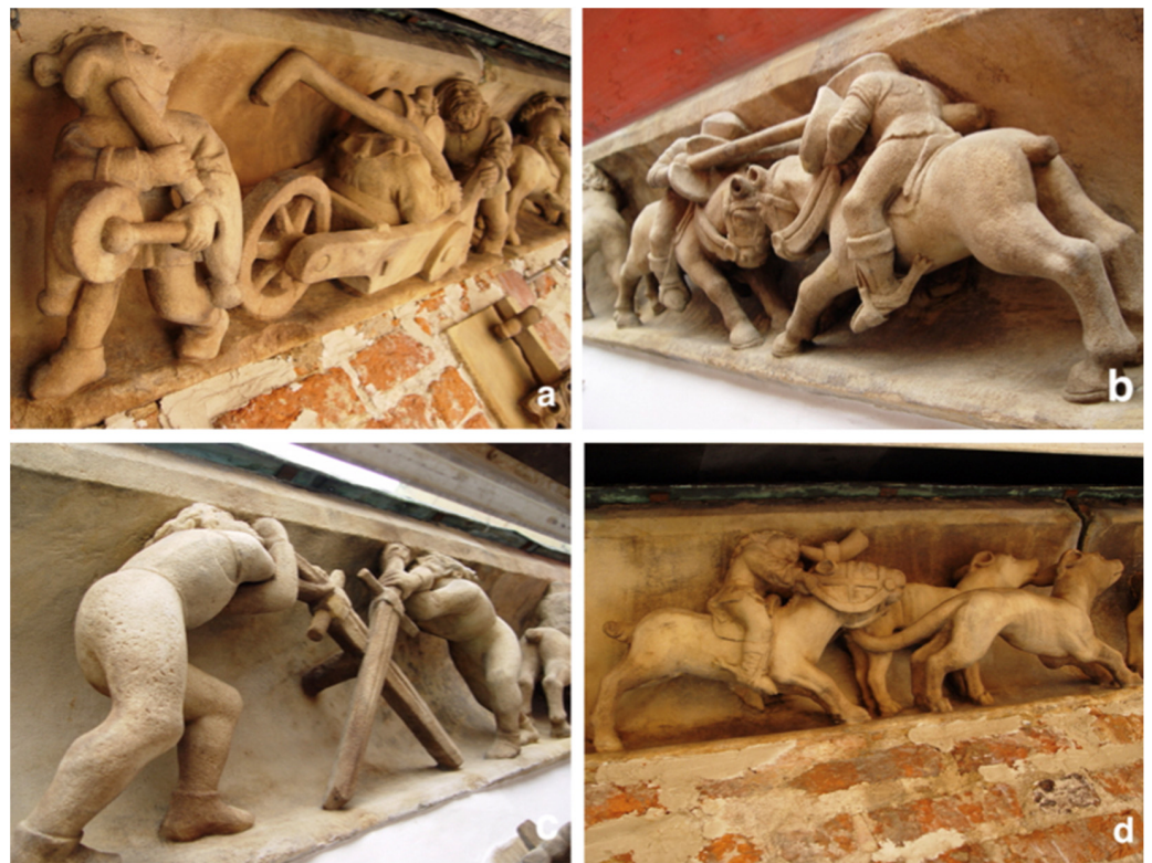
Figure 7. (a–d). Wrocław Town Hall, southern façade, sculptures on the crowning cornice: (a) a woman in a wheelbarrow; (b) lance riders; (c) knights fencing with swords; (d) deer hunting.