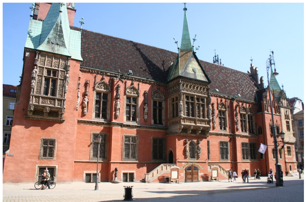
Figure 4. Wrocław Town Hall, southern façade, (Photo by the authors).

The western avant-corps was also rebuilt. Its walls were dismantled to a height of about 5.70 m. The framing of the ogival opening on the southern wall was removed, and the opening itself was blocked with a brick wall and stone blocks. Parts of the ground floor were also rebuilt by extending the avant-corps to the west by 1.2 m. The form of the eastern avant-corps was also changed. Its south-west diagonal wall was dismantled to the level of the Market Square. The same was done with the vault, which was bricked up. The perimeter walls were built up to the present height. The southern façade on the first floor has two axes and two ogival window openings, which were probably decorated with stone tracery. The façade was finished with a triangular gable with ancillary columns, and lesene that was decorated with pinnacles. Moreover, a richly decorated bay window, supported on corbels, was placed in the east. A similar form was given to the bay window that crowns the central avant-corps, as well as to the one to the west that is more modest in its form (Figure 4).