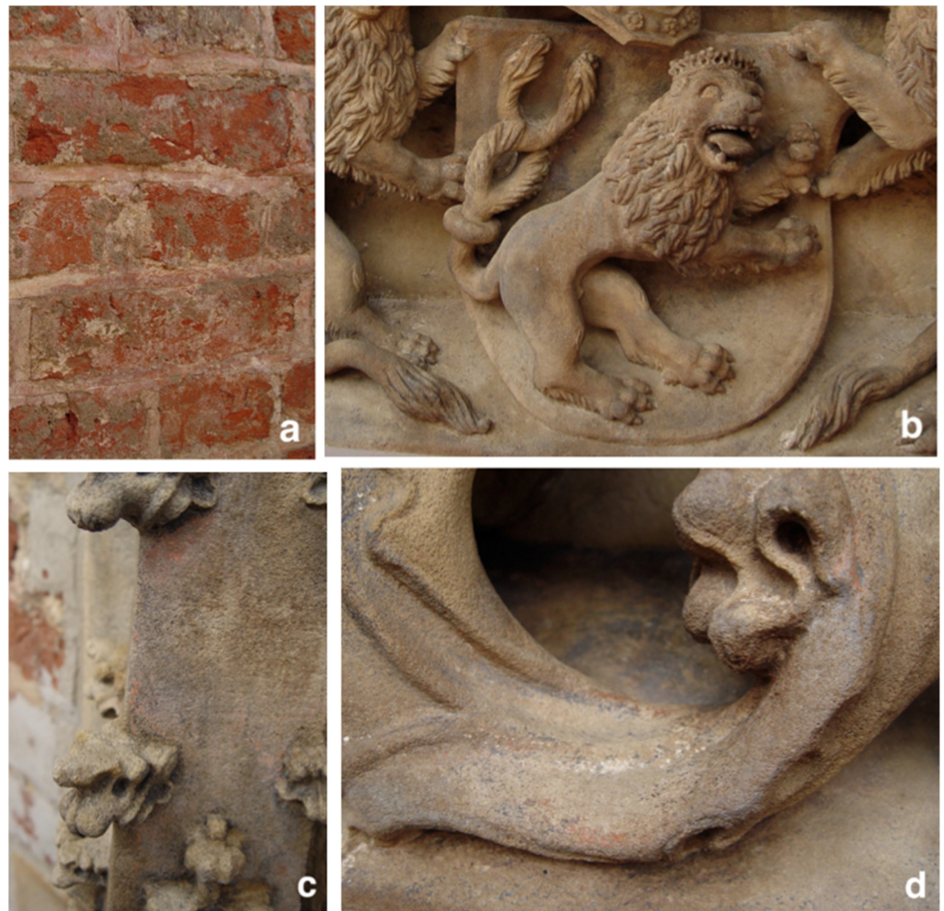
Figure 8. Wrocław Town Hall, southern façade (the third phase of constructing the façade and the first colour phase (1471–1486)); (a) remains of colours: a brick surface with traces of red monochrome; (b) remains of colours within the tympanum: white on the Lion on the coat of arms of the Czech Kingdom and on both lions supporting it; (c) detail of a pinnacle with traces of iron red from around 1486; (d) red and white on the sash.