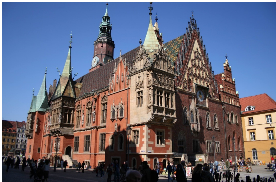
Figure 1. Wrocław Town Hall, southern façade—eastern corner.

Restoration work carried out in the years 2004–2005 on the southern façade of the late Gothic Town Hall in Wrocław enabled the hall's architectural and colour changes to be clearly identified (Legendziewicz and Polak 2005). Based on interdisciplinary architectural, stratigraphic, and chemical studies, as well as on analyses of the building's iconographic representations, it was possible to recreate and trace the transformations of the colour patterns of its most representative façade (Figure 1).