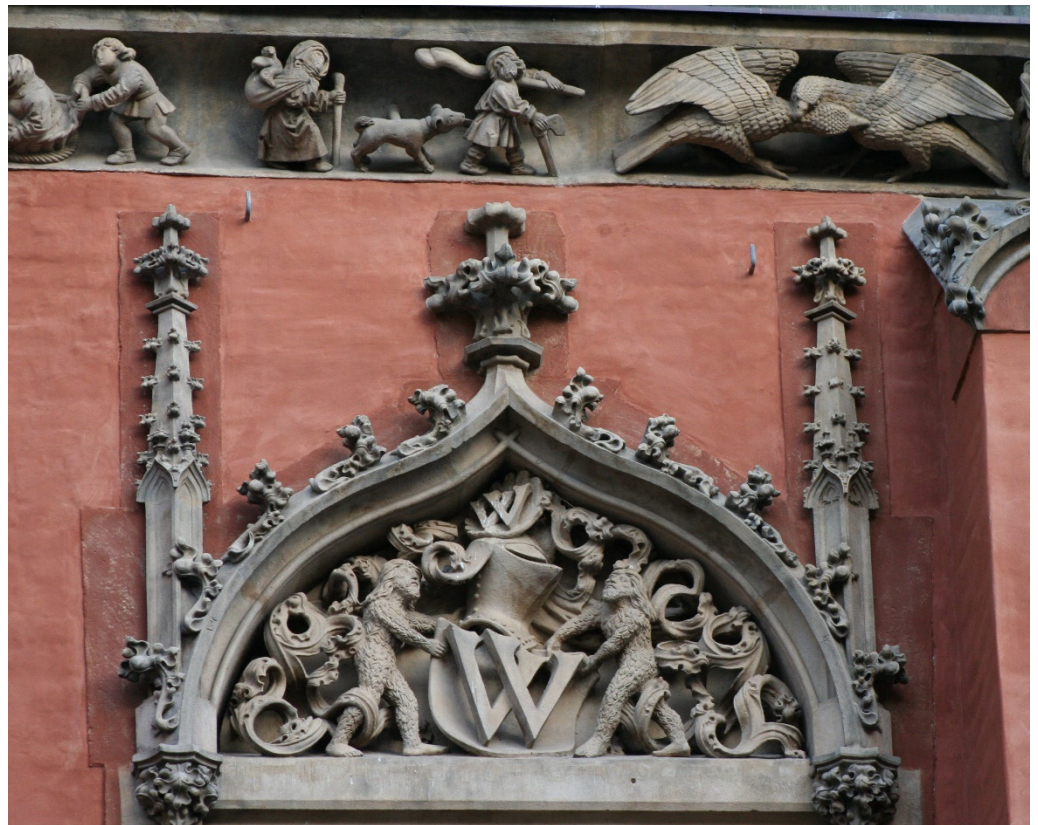
Figure 5. Wrocław Town Hall, southern façade, window tympanum of the first floor with a coat of arms with the letter “W” supported by “wild men” (Photo by the authors).

The façade has distinctive decorated bay windows in three avant-corps (Figure 5). Two of them (west and middle) are covered with carpet ornaments with floral and geometric motifs. In the corners of the bay windows there are cantilevers for figural sculptures. The cantilevers have engraved angels, and below them there are figures of townspeople, e.g., a trumpeter, a piper, and an innkeeper. The most decorative central bay window is enhanced in its upper part with a strip of ogee-shaped arches, which is decorated with flowers. The eastern bay window is topped with a roof framed by triangular gables with ogival tracery and coats of arms: with the Jagiellonian Eagle (west side), with the head of St. John the Evangelist (east side), and the Czech Lion (in the crowning). The east part of this window is decorated with intertwining ogee-shaped arches topped with pinnacles, and its southern part has a window tympanum with intertwining ogee-shaped arches. The second southern gable of the bay window is decorated with pinnacles. Between these decorations, there are four figures of saints: Andrew, Elizabeth, Mary Magdalena, and Lawrence. Below, between the bay windows of the first floor, there is a sculpture of St. Christopher, and at the height of the inter-story cornice there is a sculpture of St. John the Baptist. The rich sculptural decoration of the bay window and the façade was made by the master Briccius Gauske (Zlat 1976, p. 90).