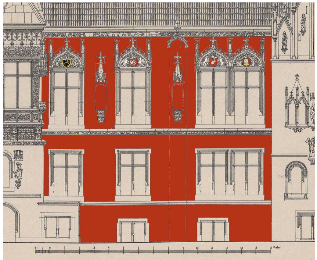
Figure 10. Wrocław Town Hall, southern façade, a fragment of the façade with a partial reconstruction of the colours, the first colour phase from around 1486 (the colour remains found on the brick face and on the stone surface do not allow for a fully reliable reconstruction of the colour scheme of the stone detail). Created by the authors—adapted a drawing from (Lüdecke 1898, drawing 6 (Dolnośląska Biblioteka Cyfrowa, sygn. PWr 370763, public domain)).

these findings, as well as on heraldic studies and historical presentations of the coat of arms of Wrocław, it seems possible to reliably recreate these elements.