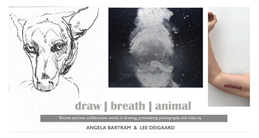
Figure 1. Draw | Breath | Animal, exhibition poster, Tippetts and Eccles Galleries, 2021.