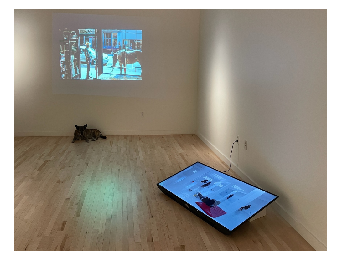
Figure 3. Be Your Dog (floor monitor) and Gus and Deuce Go Elsewhere (wall projection), with Elvira, in the Draw | Breath | Animal exhibition, Tippetts and Eccles Galleries, 2021.

The reviewing of video footage after the fact (such as ongoingly with Be Your Dog , Bartram, and Gus and Deuce Go Elsewhere , Deigaard [Figure 3]) not only teaches and informs us of interactions and animal communications (ears swivelling, body language) that can outpace human perception in real time, but also gives rise to layered and significantly symbiotic artworks and related iterations across disciplines. Bodily engagement and mutual sensory immersion yield insights, reflective and documentary, of acts of companionship shared in (otherwise and normatively human-centric) artistic space. Bartram's Be Your Dog , a documentary video of a dog and human artistic pack formation within Karst, a gallery in Plymouth UK, made collaboratively in 2016, explicitly invokes the engagement of bodies in concert and response, and of the human following the animal's lead towards heightened empathetic access. Deigaard's Gus and Deuce Go Elsewhere invites the curiosities and disproportionate considerations of horses' free entry into a museum, emphasising their crucial autonomy in choosing to enter or not, and their horse-directed explorations of its contents towards their own enjoyment.