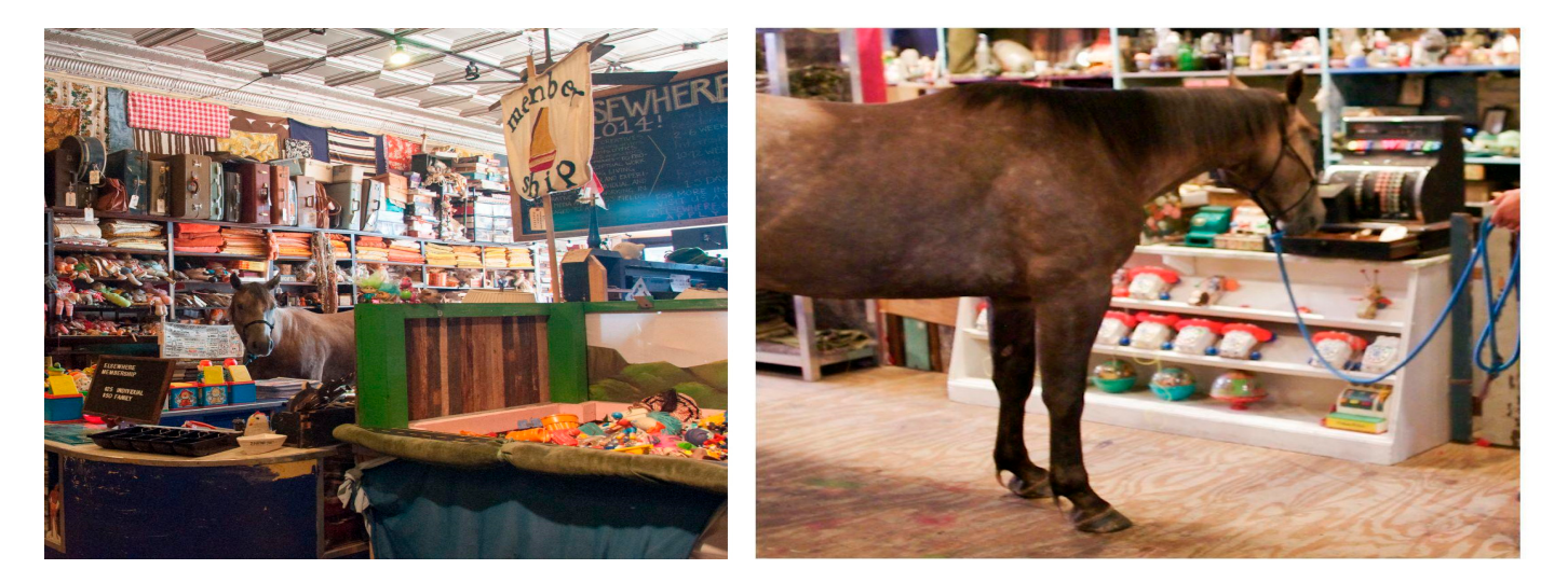
Figure 6. Gus and Deuce Go Elsewhere, supplementary project documentation, Elsewhere Museum, Greensboro, NC, 2014.

The context of the site is important in both artworks. Had either happened in a park or a field, the dogs and horses would not naturally be seen within art and potentially as artists. The gallery and museum are crucial; a visitor assumes, and potentially expects, that performing bodies and material things placed within their walls belong to artistic,