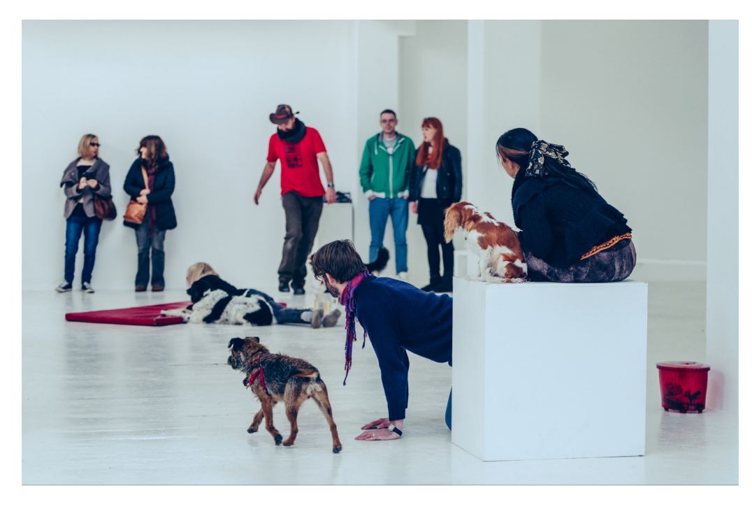
Figure 4. Be Your Dog, public performance, Karst Gallery, 2016.

There is curious and predetermined play within Bartram's Be Your Dog that the artist intends as a positional statement affirming equity, empathy, and creative agency within interspecies dialogues (Figure 4). The public performance, as seen in video footage on the floor-mounted monitor within the Logan exhibition, took place within Karst, the host gallery in Plymouth (UK) in November 2016. Seven pairs of dogs and their humans were selected from an open call to create an interspecies artistic pack. Participants were selected based on the human's descriptions and understandings of empathy within their domestic relationships with their dogs. The invitation to participate did not concern human-centric privilege or gratification, and selection was based on the person's willingness not to be dominant in this context but in service to their dog's experience. The participants did not know the artist. The selected dogs represented many breeds and sizes and were of mixed gender, as were the humans. All brought their own sensibilities. Two consecutive weekend workshops took place before the eventual public performance.