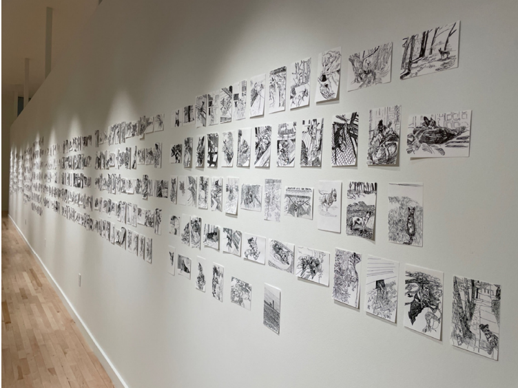
Figure 12. Quarantine Drawings , in the Draw | Breath | Animal exhibition, Tippetts and Eccles Galleries, 2021.

Author Contributions: Both authors contributed equally. All authors have read and agreed to the published version of the manuscript.