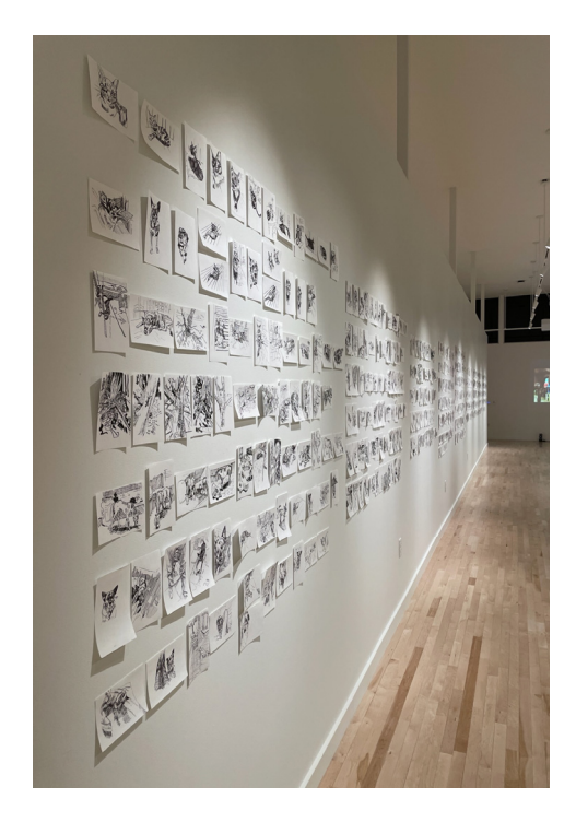
Figure 8. Quarantine Drawings , in the Draw | Breath | Animal exhibition, Tippetts and Eccles Galleries, 2021.

Bartram made her three hundred and sixty-six prints from a single etching plate. She exhaled onto its surface every day in 2016 which was a leap year and chosen for its rhythmic oddity and even number. The mouth symbolic and animal, a speechless and positioned maw for the artist in this context, behaving its mammalian and autonomous urge to breath. Against all the odds (experts told her it was impossible to etch with breath alone), her three hundred and sixty-six open-mouth deep daily exhalations upon the etching ground, through amalgamation and codified repetition, in fact engraved a clear image onto the A5 sized plate. Animal persistence bore result. Over the next three years, between 2017 and 2020, she made three hundred and sixty-six prints from that plate, an act, in its inclusive entirety, that constituted a reclamation and reactivation (an inhalation) of these breaths through the plate's erosion as well as deposition upon the paper in ink and stasis. With every run through the etching press, the plate degraded, losing depth (what holds the ink darkest) and the accumulating images also lost depth (and darkness), becoming ghosts of the initial corresponding actions and sequence now long past. The breath, through repetition and process, was eventually lost.