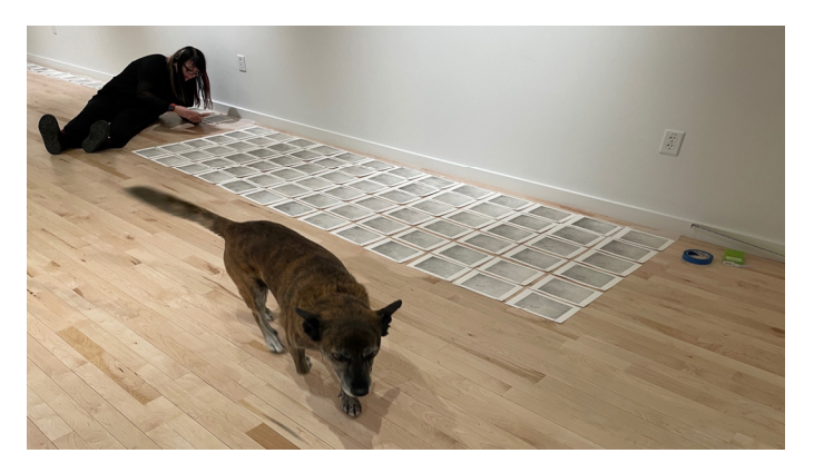
Figure 9. Installing 366:366 (Finally) , with Elvira, in the Draw | Breath | Animal exhibition, Tippetts and Eccles Galleries, 2021.

In Draw | Breath | Animal , the two videos were exhibited respectively at the eye level of horses as a wall projection (Deigaard's artwork) and on the floor where dogs (Bartram's artwork) could freely look. Deigaard's companion dog joined the collaboration in the gallery for this exhibition, aligning herself (along the upturned monitor) during their joint lecture as well as with the artists, and roamed freely within the space during installation of all the artworks included. In the gallery, their large-scale projects 366: 366 (Finally) and Quarantine Drawings were installed simultaneously along a long, fixed wall, a central spine dividing the gallery through its centre. Each could not see the other, but they worked in rhythm to enmesh as collaborators, only as far apart as the depth of the wall and without speaking to the other. Installation, too, was a test of endurance and devotion; the dividing exhibition wall was fifty feet long, and each artist hung hundreds of sheets of images simultaneously over a continual seventeen-hour installation period. Throughout the installation, Elvira was activating the process; she was encountering the work in the space as audience, as participant, as subject matter, protagonist, and muse. (Figures 9 and 10).